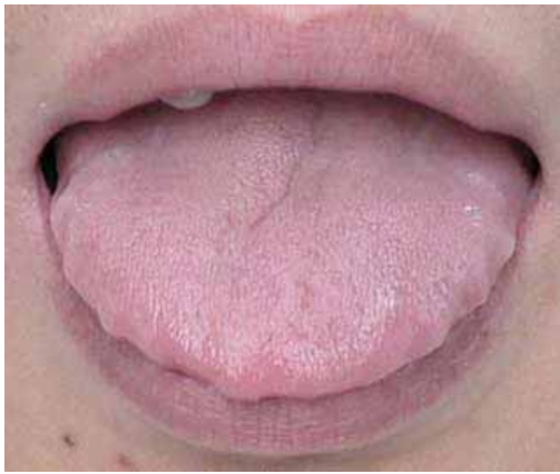
Fig. (1). Illustration of a relatively large tongue (see the imprints of the lateral margins of the tongue).

association between paediatric SDB and daytime sleepiness requires additional assessment.