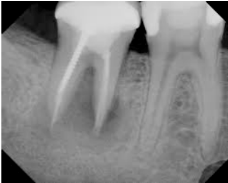
Fig. (2). Iopa of second molar of the lower jaw shows overfilling with guttapercha cone causing abscess and paresthesia.

As with any therapeutic modality, complications may arise during endodontic treatment. Tschamer, Kaufman and Rosenberg [7] found that the effect of overfilling the root canal with paraformaldehyde will damage the periodontal ligament. Whereas Heling et al. and Tal et al. Kaufman and Rosenberg reported several cases in which overfilling with sealer containing paraformaldehyde resulted in alveolar bone necrosis [8].