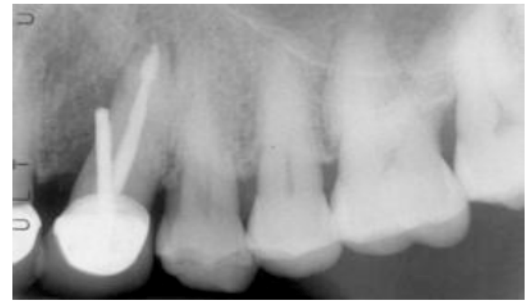
Fig. (3). Perforation of the pulp chamber.

such tooth as the lateral perforation is difficult to seal. Additional problems are root resorption and vertical root fracture.