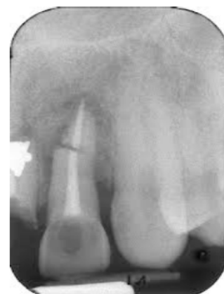
Fig. (4). Root fractures.

Root Fractures (Fig. 4) caused by traumatic forces or restorative endodontic procedures may lead to periodontal involvement through an apical migration of plaque along the fracture when the fracture originates coronal to the clinical attachment and is exposed to the oral environment.