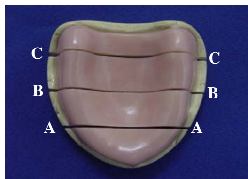
Fig. (1). Transversal cuts in base-cast set: canine (A), first molar (B), and posterior palate (C).

The base-cast sets were transversally sectioned in a sawing device (Precat Manufacturing Co., Piracicaba, SP, Brazil) into 3 sections: canine, first molar, and posterior palate (Fig. 1). The gap between the acrylic resin base and stone cast was measured in the 3 sections at 5 points, corresponding to the right and left residual ridge crests, the midline, and the right and left marginal limits of the flanges. Arithmetical mean of the reference points of each section was considered as the adaptation value for each section [27] (Fig. 2). An optical micrometer (STM; Olympus Optical Co, Tokyo, Japan)