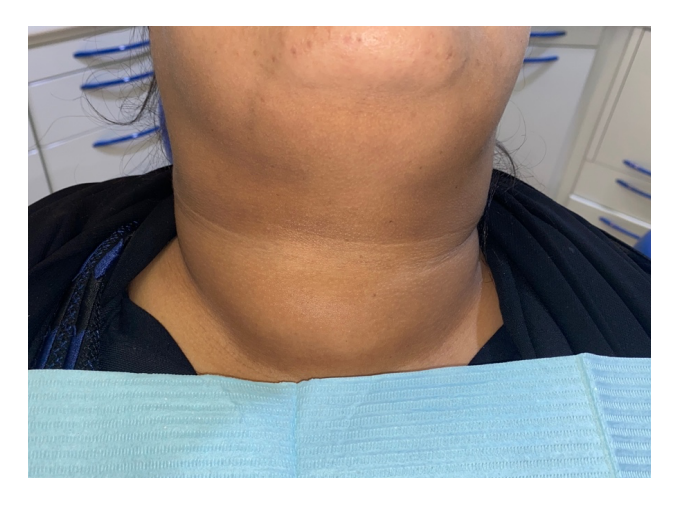
Fig. (1). Right thyroid enlargement.

underwent urgent total thyroidectomy, and surgical histopathology confirmed multiple goiters and was negative for malignancy. The patient is currently receiving thyroid replacement therapy (Levothyroxine 150 micrograms taken once a day) without complications. The patient is scheduled for follow ups with the endocrinologist. Ethical approval was waived by the institution as this is a case report. A written informed consent was obtained from the patient before proceeding with the publication of this case report. This paper agrees with the Helsinki declaration principles.