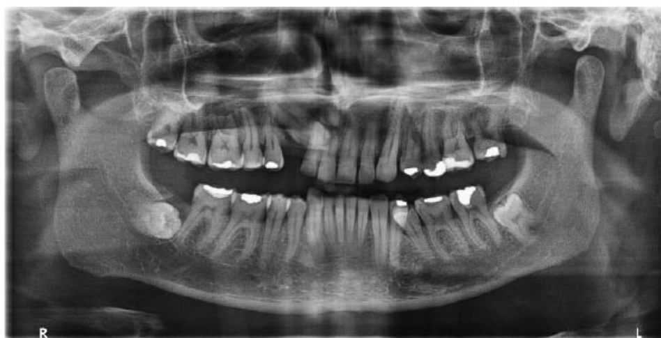
Fig. (1). Panoramic radiograph taken prior to the extraction of tooth 38.

The patient underwent antibiotic therapy with intravenous Clindamycin 600mg every 8 hours, along with associated analgesics, in a hospital setting. After a 7-day period, the patient was discharged from the hospital with the continuation of the antibiotic regimen at home, administered orally, for an additional 30 days. After completing the medication, the patient exhibited signs of clinical improvement, indicating that, at that point, there was no need for surgical intervention or continued antibiotic use. It needs to be emphasized that subsequent follow-up appointments were scheduled; however, the patient did not attend the outpatient clinic, and attempts to establish contact were unsuccessful.