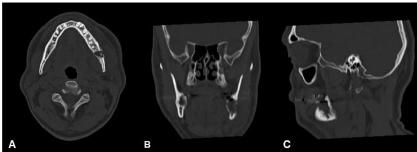
Fig. (2). CT demonstrating areas of bone sequestration: axial slice (A), coronal slice (B), and sagittal slice (C).

Approximately one year after the presented condition, the patient came to the service complaining of intense pain in the left submandibular region, associated with the increase in volume and presence of purulent secretion, denying that there had been any type of trauma episode in the region. During the clinical examination, mandibular mobility upon manipulation was observed. The patient denied experiencing or hearing any clicks from the region.