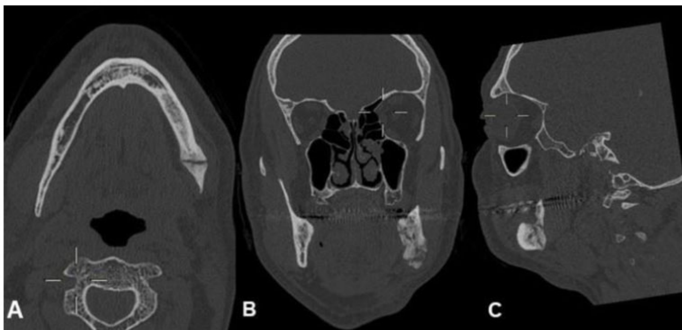
Fig. (3). CT showing a bone fracture in the region of tooth 38: axial section (A), coronal section (B), and sagittal section (C).

the region of tooth 38 was verified, as well as destruction of the buccal cortical bone, being replaced by a neoformed cortical bone (Fig. 3). For this reason, a surgical approach was planned for the patient's rehabilitation through the fixation of the pathological fracture. The surgical procedure involved curettage of the existing granulation tissue, regularization of the cortical plates with the removal of the bony callus, application of L-PRF, and installation of a titanium reconstruction plate with screws for the alignment and stabilization of the bone fracture.