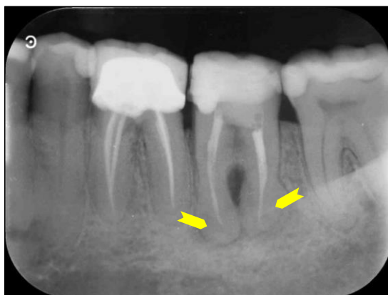
Fig. (1). Periapical radiograph showing two well-circumscribed radiopaque masses (yellow arrowheads) overlapping the roots of the mandibular left second molar.

As an incidental finding at the level of the apical third, a thickening of the roots was observed due to the symmetrical and excessive deposition of a radiopaque material (hypercementosis). The periodontal ligament and lamina appeared normal (Fig. 1). The clinical and radiological findings were consistent with a diagnosis of asymptomatic apical periodontitis with hypercementosis. These initial findings were corroborated with a panoramic reconstruction (Fig. 2). In a preoperative tomography (CBCT) provided by the patient at the time of consultation, different sections presented with hyperdense roots and hypodense zones compatible with hypercementosis and apical periodontitis, respectively (Fig. 3). A treatment planning decision identified exploratory surgery, as a diagnostic way to rule out the possibility of a root fracture, due to the previously described radiographic findings. The prognosis the tooth was established as guarded.