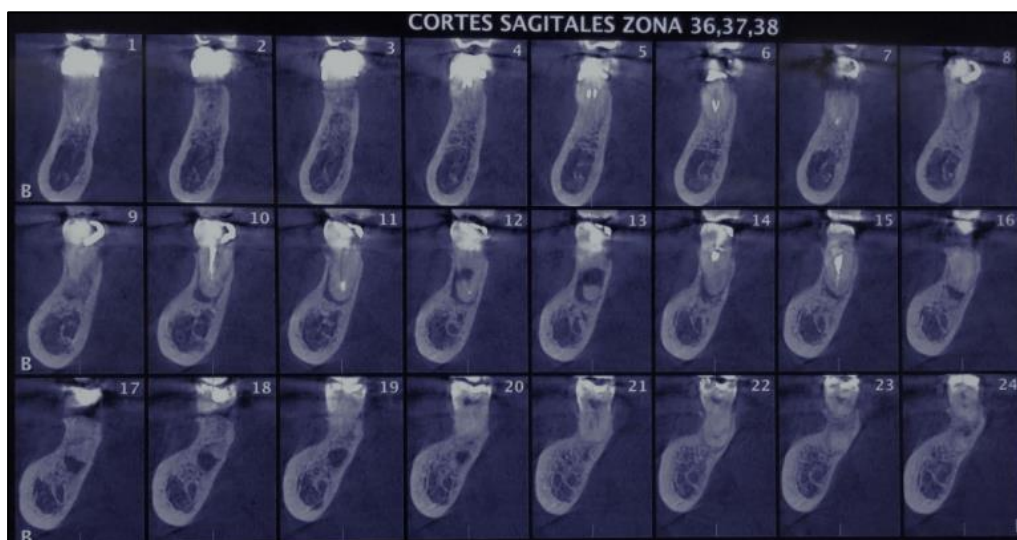
Fig. (3). Preoperative tomography shows in different sections of the roots hyperdense zones compatible with hypercementosis and hypodense zone compatible with periapical lesion.

Surgically, an intrasulcular tissue incision was made and a tissue flap was reflected from mesial of tooth 36 to distal of tooth 38. No radicular fracture was observed and the granulomatous tissue in the interradicular zone was curetted. A small dental crack was observed on the mesial surface of the distal root, which was removed with a conical bur at high speed. The reflected tissue was repositioned and the patient was instructed to attend follow-up appointments at 3, 6, 9, 12 months, with subsequent yearly assessments. Presently, the patient has not returned for the requested follow-up appointments, which often happens when there are no signs or symptoms. In this case, apical surgery was not performed due to the finding of hypercementosis and the impossibility of establishing an accurate apical limit in this condition.