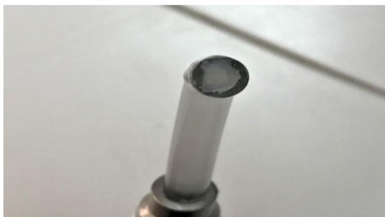
Fig. (1). A layer of composite residue covering most of the tip of one LCU as received before cleaning.