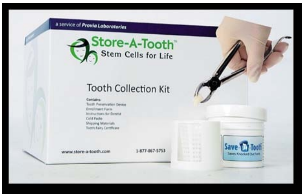
Fig. (3). Tooth collection kit.

Usually, parents/patients who are interested in banking stem cells from teeth should get enrolled with any of the nearest stem cell banking services which are commercially available in the market OR the dentist informs and educates the patients about tooth banking. It is essential to intimate that obtaining stem cells from closely related family members with a positive history of genetic, cancer, or other types of diseases should be avoided. The dentist then fixes an appointment for extraction. Further, the organization will work directly with dentist's office to facilitate all necessary materials and instructions. For example, Store-A-Tooth company provides a tooth collection kit (Fig. 3). It is always advisable for a dentist to get registered well in advance of the arrival of the patient.