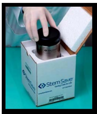
Fig. (2). Thermo safe box.

Following extraction, the dentist scrutinizes the tooth visually to affirm the presence of healthy pulpal tissue and the sample is transferred into a container whose usual capacity is up to four teeth. The contents of the container include a sterile saline solution in order to supply nutrients and prevent dehydration during shipment. The container is carefully sealed and placed in thermette (Temperature change phase carrier). The thermette is then shifted to the insulated metal box (Fig. 2). This process maintains the sample in a hypothermic phase and is referred as sustentation. It is important to note the viability of the stem cells is dependent on time and temperature therefore necessary care is required. The maximum time span time from collection to arrive at the processing storage facility should not exceed 40 hours.