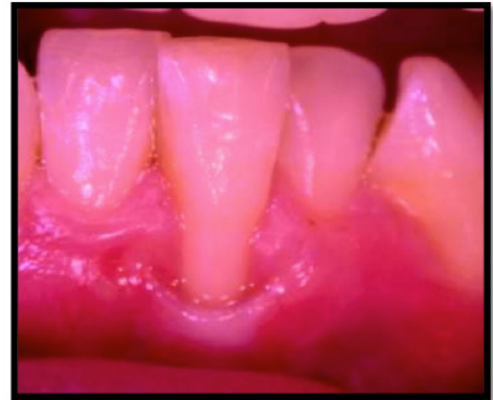
Fig. (6). Gingival recession.