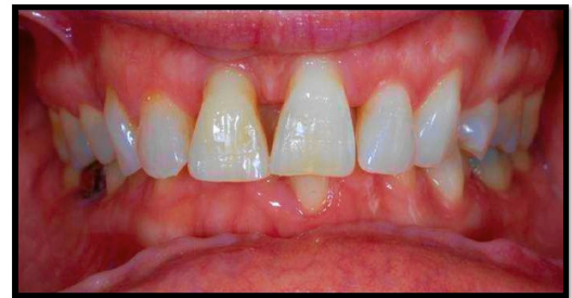
Fig. (2). Black triangle.

Black triangle Fig. (2) or open gingival embrasure can occur as a complication in about 1/3 of all adult patients & it should be discussed with patients before initiating orthodontic treatment [24].