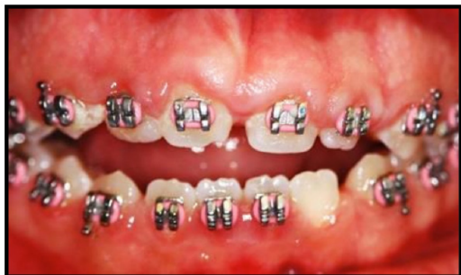
Fig. (4). Inflammatory gingival enlargement of labial anterior gingiva during orthodontic treatment.

Gingival recession (receding gums) (Figs. 6, 7), is the exposure in the roots of the teeth caused by a loss of gum tissue and/or retraction of the gingival margin from the crown of the teeth.