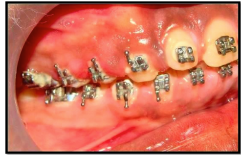
Fig. (5). Right lateral view showing inflammatory enlargement.