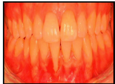
Fig. (7). Gingival recession.

Several classification systems are in use to help diagnose gingival recession: