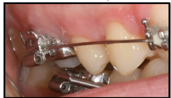
Fig. (3). Mucosal trauma caused by a fixed appliance component.

Few of the aspects which should be taken into consideration when treating a patient with reduced bone support are the risk of further bone loss which might lead to the loss of teeth, & a change in appliance as well as treatment mechanics [26]. Orthodontic forces may lead to the destruction of periodontal bone support through the induction of pro-inflammatory cytokines & also by decreasing the expression of matrix proteins and osteogenic protein [27]. Irritation factors, such as ill-fitting band margins, variable form and dimension of the interdental embrasure during movement and tooth movement itself exerts a toll on the periodontium.