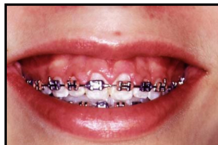
Fig. (1). Gingival inflammation caused by orthodontic brackets.

responses [1]. The undesirable side effects of orthodontic treatment are tissue damage, treatment failure & increased predisposition to dental disorders.