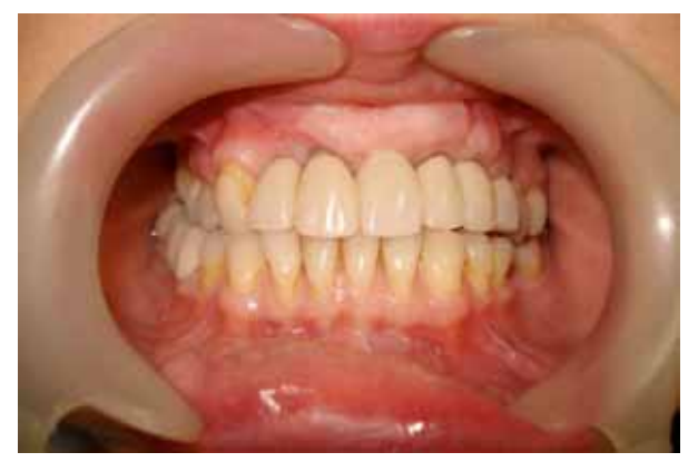
Fig. (6). Provisional restorations with over contouring in the central tooth area.