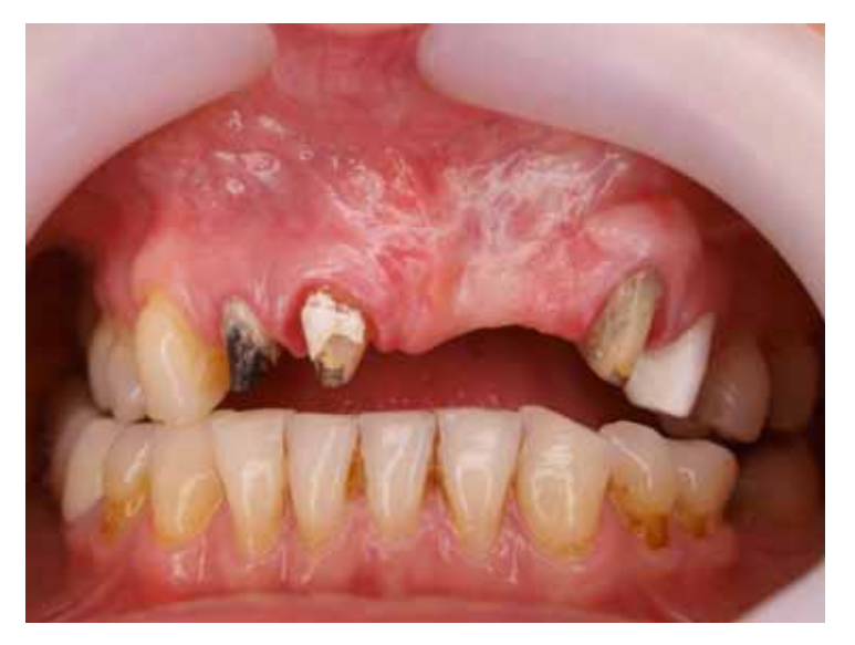
Fig. (1). Patient prior to treatment.