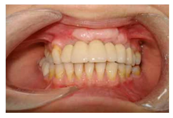
Fig. (8). Clinical appearance after prosthetic rehabilitation was completed.

implant procedures was to create sufficient bone and KM in preparation for the implants. Initially, KMW increased via the FGG. A FGG was also used to cover the block bone graft completely and to enhance healing. Thus, the implant site was prepared for augmentation by application of the FGG graft. This method is an alternative to the "controlled tissue expansion" technique [14]. Increasing the KMW benefited peri-implant tissue health.