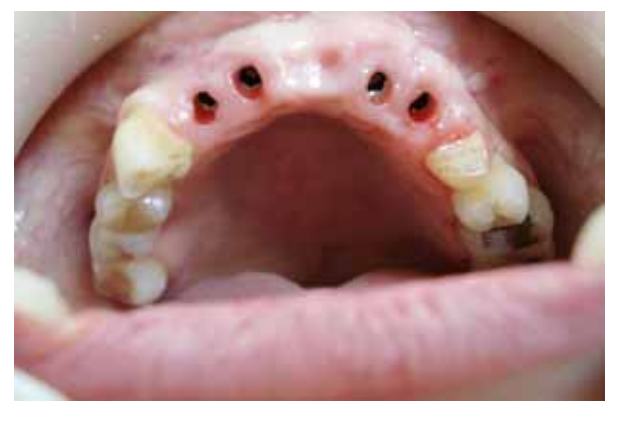
Fig. (7). Papilla formation in edentulous area.

with over contouring. To prevent infection, the pontic was polished carefully, and restoration was temporarily luted (Fig. 6). Follow-up visits were continued until we were satisfied with the appearance of the papilla and alveolar ridge at the end of the fourth month (Fig. 7). At that time, definitive bridges were fabricated using metal-ceramic restorations. At the 24-month follow-up, the patient had no functional, psychological, aesthetic, or phonetic problems (Fig. 8).