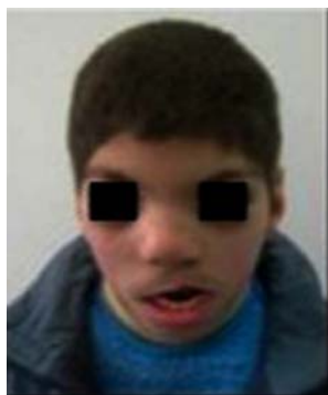
Fig. (1). Frontal view of the patient.