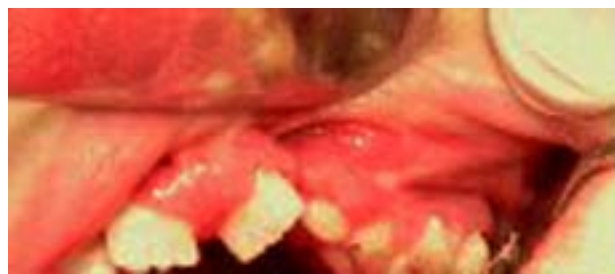
Fig. (2). Sequela of cleft upper lip cicatrization.

2001), gastroesophageal reflux, and severe psico-motor retardation.