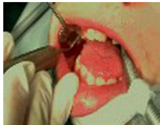
Fig. (3). Operative treatment. Professional oral hygiene.