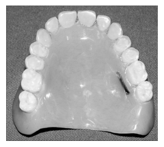
Fig. (8). Denture, with incorporated, RFId finished and polished.

rated radio frequency identification tag, the technical procedures for its incorporation in the denture resin and its working principles. There are several advantages in using this labeling system. The dentist without requiring special training or a dental technician can easily set the tag in the denture, since every dental surgery is equipped to carry out prosthetic adjustments and has auto polymerizing acrylic resin. Because of the tag's size there is no real weakening of the denture as would be expected with metallic markers. Should the patient need laboratory reline or rebase there is no need to remove the device from the denture before reline/rebase and finishing procedure.