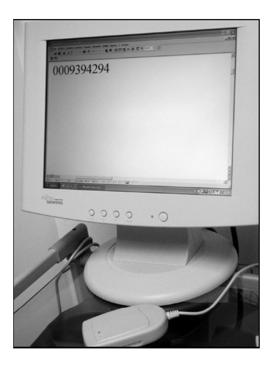
Fig. (4). Signal transmitted displayed on the pc monitor under a word processor.

situation, such as during the tsunami disaster in 2004 by the Austrian DVI team [9]. The RFId technology can be also employed as an aid for forensic dental identification based on the comparison of ante-mortem and post-mortem dental records, by placing a small transponder in teeth [10,11] and dental prostheses [12,13]. Determining the various individual characteristics of the human dentition has proved an effective aid in the task of identification. Edentulous people on the other hand, have lost all or most of the key features that have proven valuable in such cases, hence the identification process is made much more difficult unless the victims wear marked dentures [14]. Over the years various denturemarking systems have been trialled [15, 16]. These can be divided into surface marking and inclusion methods. Inclusion methods involve the incorporation of metallic or nonmetallic labels, barcodes [17] or microchips [18, 19]. The RFId small transponder has not been popular owing to its high cost and relative unavailability. An attempt was made therefore to develop a denture marking system which improves on previous systems in terms of its simplicity, cost