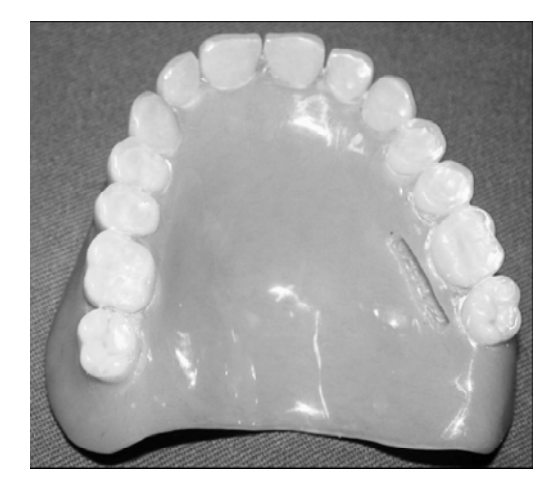
Fig. (6). Depression prepared in the denture ready for the tag incorporation.