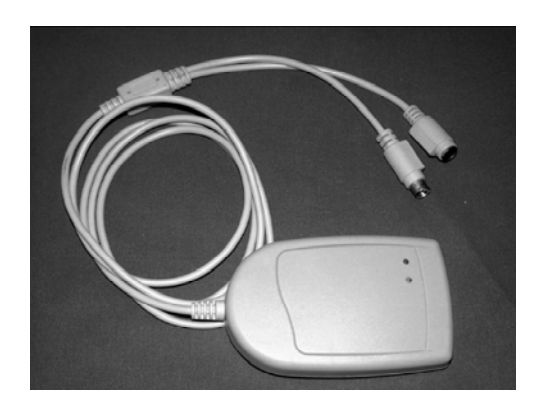
Fig. (3). RFId tag Reader to be connected to a computer in the keyboard jack.

situation, such as during the tsunami disaster in 2004 by the Austrian DVI team [9]. The RFId technology can be also employed as an aid for forensic dental identification based on the comparison of ante-mortem and post-mortem dental records, by placing a small transponder in teeth [10,11] and dental prostheses [12,13]. Determining the various individual characteristics of the human dentition has proved an effective aid in the task of identification. Edentulous people on the other hand, have lost all or most of the key features that have proven valuable in such cases, hence the identification process is made much more difficult unless the victims wear marked dentures [14]. Over the years various denturemarking systems have been trialled [15, 16]. These can be divided into surface marking and inclusion methods. Inclusion methods involve the incorporation of metallic or nonmetallic labels, barcodes [17] or microchips [18, 19]. The RFId small transponder has not been popular owing to its high cost and relative unavailability. An attempt was made therefore to develop a denture marking system which improves on previous systems in terms of its simplicity, cost