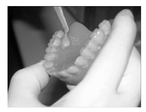
Fig. (7). The tag is covered with pink auto polymerizing acrylic resin.