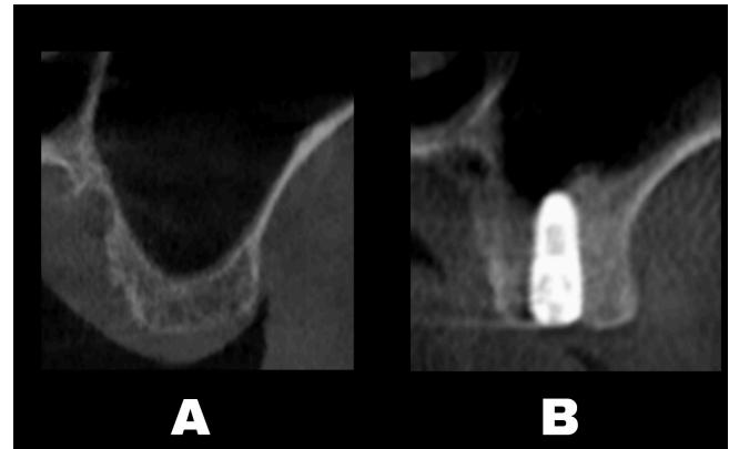
Fig. (3). CBCT was performed before surgery (A), and after 9 months (B).

Intra-sinus bone gain refers to the difference between the bone height after 9 months and the Initial Bone Height measured initially.