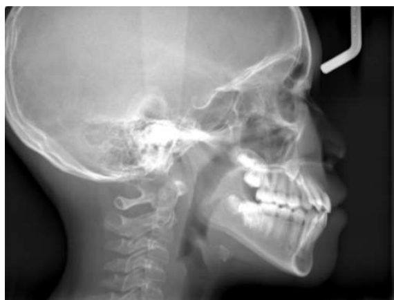
Fig. (2). Pretreatment cephalometric radiograph.