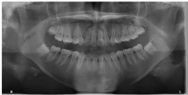
Fig. (7). Posttreatment panoramic radiograph.