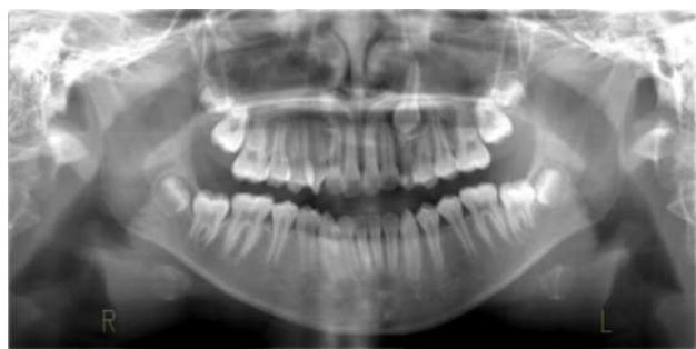
Fig. (3). Pretreatment panoramic radiograph.

Several treatment options, with pros and cons, were