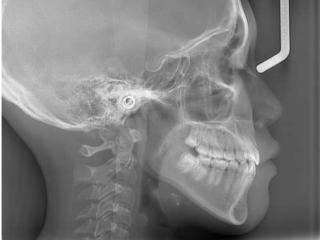
Fig. (6). Posttreatment cephalometry radiograph.