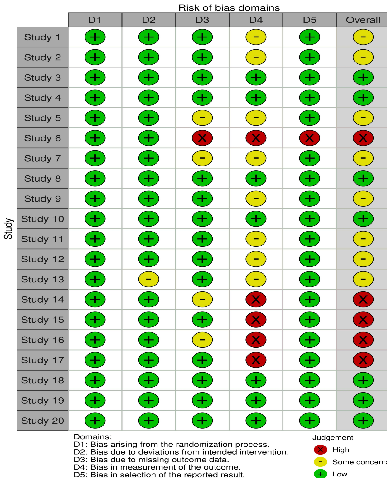
Fig. (2). Describes the assessment of the risk of bias with RoB 2.0 tool.