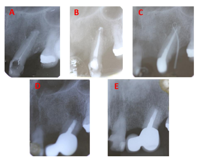
Fig. (1). Conventional periapical radiographs (CPR). (A) Preoperative CPR. A round radiolucent area surrounding the tooth apex can be appreciated. The outline of the latter is radiopaque and irregular, suggesting a calculus-like deposit. Root-filling material appears "loose" inside the main canal, clearly denoting an improper RCT. A poorly adapted restoration is seen on the mesial side of the crown as well as a small and curved fragment of wire, just on the orifice of the main canal. (B) Postobturation CPR. This clearly shows the improvement upon the previous RCT depicted in (A). (C) CPR was taken after tracing the sinus tract with a gutta-percha point. Note that the radiopaque point indicated tooth 23 as the origin of the sinus tract. A reduction in periapical lesion size can also be noticed, as well as the previously cemented cast metal post. (D) Post-endodontic surgery CPR. (E) Follow-up CPR was taken two years after the completion of endodontic surgery. Complete resolution of the periapical lesion can be appreciated. The cantilever was well-fitted.

planned in two sessions and the patient was warned that if the symptoms/and or the apical lesion did not resolve after the retreatment, he certainly would require endodontic surgery. Prior to the clinical procedures, informed consent was obtained from the patient.