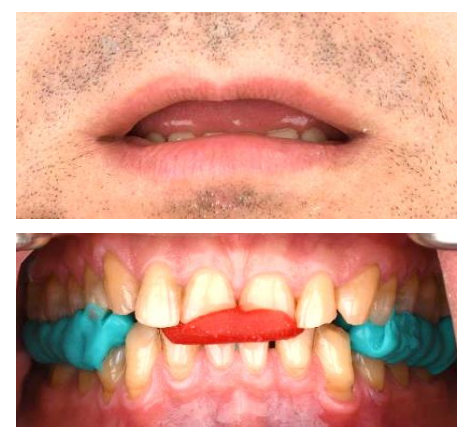
Fig. (2). (a) Lower incisal plane is mock-up with flowable composite and verified (b), Centric relation record using anterior jig.

Based on the earbow record, the maxillary cast was mounted on the articulator (Hanau Wide-Vue Arcon 183-2, WhipMix Corp, Kentucky, United States). Then, the mandibular cast was mounted against the maxillary cast using the jig and the CR record (Fig. 2B). The Broadrick flag was used to estimate the posterior plane on each side. The wax-up procedure was done based on the defined occlusal plane, and the putty index (Speedex, Coltene, Switzerland) was prepared intraorally for the mockup process.