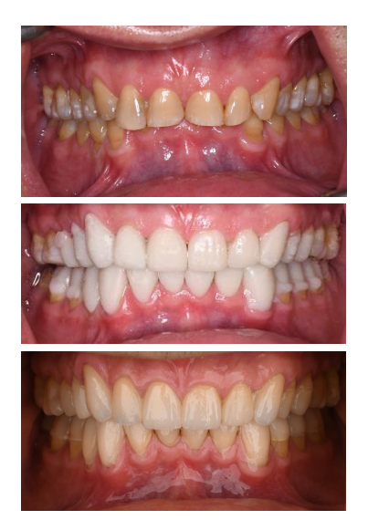
Fig. (4). (a) Intraoral frontal view of occlusion (before) (b), Intraoral frontal view of occlusion (resin patterns try-in) (c), Intraoral frontal view of occlusion (final restorations).

Pressed monolithic lithium disilicate glass-ceramic (Ivoclar, Lichtenstein) with a staining technique was chosen for all restorations. The A1 shade (VITA) was selected after consulting with the patient in standard light conditions and considering patient's skin color and age. Based on the patient's history and considering the comparative durability of dental ceramics, we decided against using direct composite resin, despite some studies advocating it as a conservative technique [11, 12].