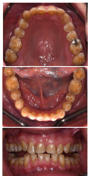
Fig. (1). Intraoral examination of the initial scenario displaying worn incisal/occlusal surfaces. (a) Maxillary arch (b), Mandibular arch (c), Exposed dentin in most inciso-labial and occlusal surfaces of mandibular teeth.

A 45-year-old male patient was referred to the Prosthodontics Department at the Dental College to treat his worn dentition. The patient presented with chief complaints of tooth surface loss (TSL), reduced chewing ability, and mild esthetic concerns, particularly regarding shade. The medical history was unremarkable, with no indications of temporomandibular joint disorder (TMD), except for excessive consumption of lemon and vinegar related to a pre-diabetes condition. Intraoral examination revealed a two-surface amalgam filling on the left second molar and composite resin fillings on the right first premolar, right second premolar, and right first molar. Abfraction was observed in several teeth of varying severity, with mild abfraction in all posterior teeth except for the right first and second molars, which showed moderate abfraction. The patient's occlusion was classified as Class II division 2 with a deep bite. All teeth displayed worn incisal/occlusal surfaces, exposing dentin in the maxillary central incisors, and limited to enamel in the maxillary premolars and most areas of the mandibular premolars (Fig. 1). The extraoral examination showed a square, symmetrical face, a slightly shorter lower third, and competent lips. The pattern of worn dentition did not match the opposing teeth, indicating that the cause of TSL was not solely due to parafunctional habits but may also have been a result of a chronic erosion progression exacerbated by job-related stress.