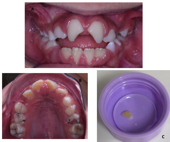
Fig. (1). Pre-operative images. (A) Fractured maxillary central incisors (tooth #11 and #21). (B) Upper view of the fractured maxillary central incisors. (C) Fractured fragment of the maxillary right central incisor (tooth #11).

A 9-year-old girl came to the emergency department with a history of uncomplicated crown fracture in the maxillary central incisors, as shown in Fig. (1).