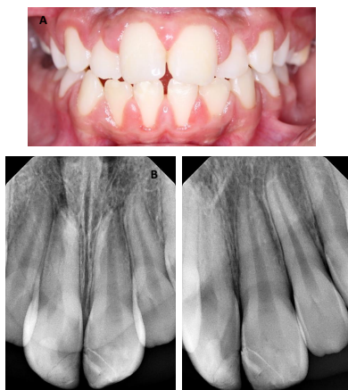
Fig. (5). Post-operative follow-up images at 2 years. (A) Functional maxillary central incisors and the occlusion was improved (B) Peri-apical radiograph showing no sign of pulpal or per-apical changes and continuing root development.

The patient was re-examined clinically and radiographically (Fig. 5). No new complaints or changes were noticed. The reattached fragment and Cl. IV resin restoration was intact. This case showed predictable clinical and radiographic outcomes. Clinically there are no signs and symptoms of pain, discoloration, pain to percussion, or increased mobility. Give a normal response to the pulp sensibility test. Radiographic success was also observed, which included signs of root maturation and no signs of periapical radiolucency or root resorption. Oral hygiene measures and the need for preventive recall visits were reinforced.