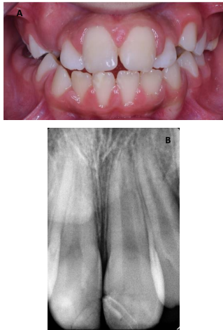
Fig. (4). Post-operative follow-up images at 10 months. (A) Functional maxillary central incisors. (B) Peri-apical radiograph showing no sign of pulpal or per-apical changes and continuing root development but the left maxillary central incisor showing signs of defective restoration.

The overall prognosis was good for both traumatized upper central incisors (teeth #11 and #21); since there are: