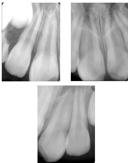
Fig. (2). Pre-operative peri-apical radiograph of the broken maxillary central incisors.

A periapical radiograph was taken for the radiographic examination as it is recommended by the International Association of Dental Traumatology, which revealed that Tooth #11 and #21 had an uncomplicated crown fracture (visible loss of enamel and dentin) with no signs of periapical radiolucency, no signs of tooth displacement, no signs of root fracture, had immature root development with an open apex (Fig. 2).