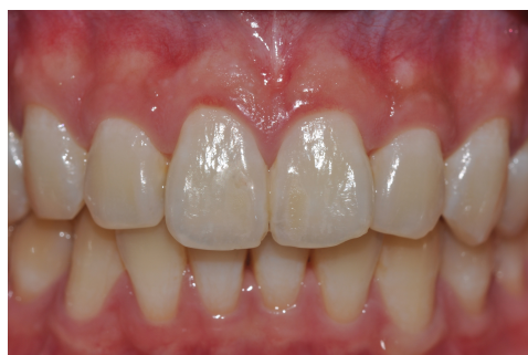
Fig 2. The appearance of all anterior teeth and the first premolar only on the camera screen.

The distance between the participant and the camera was set according to the appearance of all anterior teeth and the mesial side of the first premolar only on the camera screen, and teeth photos were taken, as shown in Fig. (2).