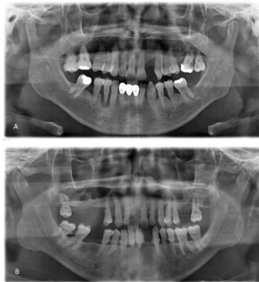
Fig. (2). Examples of patients not realising their need for dental care: (A). Patient #36 did not know whether he had gingival problems. (B). Patient #202 thought he did not have active root caries.

Regarding patients' knowledge, the causes and prevention of dental caries were unknown to 13.6% of patients, as were the causes and treatments of gum recession, gingivitis, non-carious tooth surface loss, and gingival pockets to 52.0%, 55.2%, 56.8%, and 63.2% of patients, respectively.