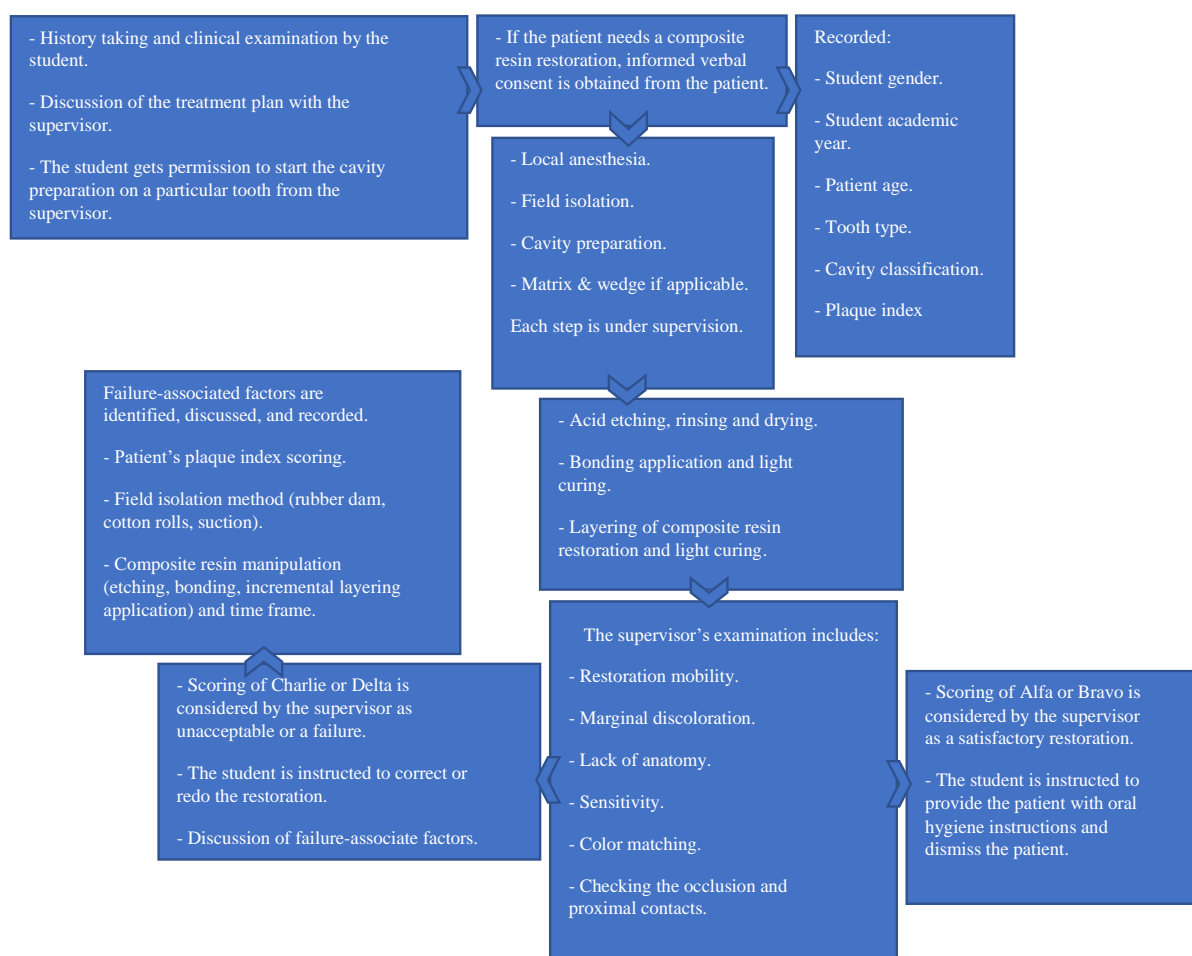
Fig. (1). Flowchart of the experimental design.