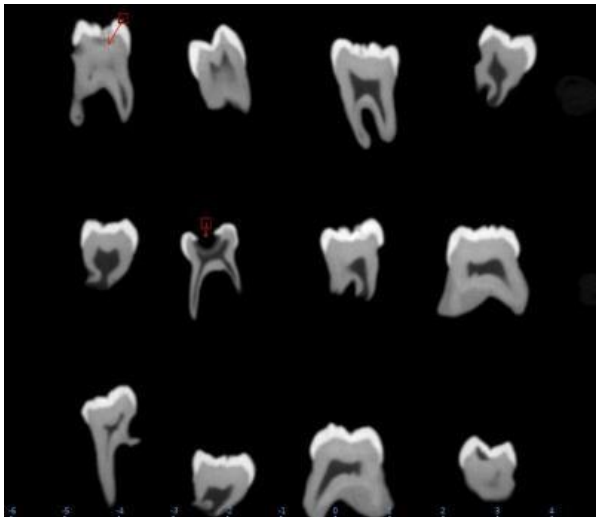
Fig. (2). Image visualization in Blue Sky Plan 4 software, coronal view.

Confined to the inner third of the dentin and the pulp chamber, assigned value: 3