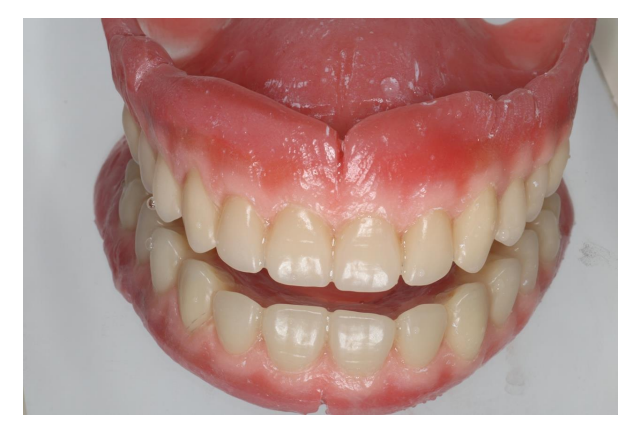
Fig. (5). Labial aspect of the maxillary denture.

The newly fabricated restorations were coated with highgloss polishing varnish and subjected to a final photopolymerization stage in the curing unit (Figs. 5 and 6) The comparison between pre-existing and new dentures clearly indicates the esthetic differences. After a final intraoral evaluation and some minor adjustments, the prostheses were delivered to the patient, who was satisfied both with function and esthetics (Figs. 7a and b, 8a and b). The 2-year follow-up also enhances these encouraging results, and the patient herself mentions the psychological improvement thanks to the prosthodontic rehabilitation.