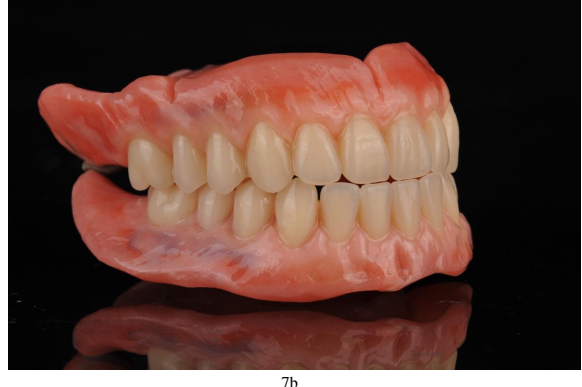
Fig. (7a and b). The final prostheses on the day of delivery, with surface characteristics and individualization of teeth and flanges.

Therefore, it is of utmost importance to follow all the rules concerning achieving sufficient stability and retention so that the patient can benefit from the clinical application of the prosthesis without having to deal with drawbacks in function or social activities. After all, despite the progress in Implantology, there are still cases when conventional dentures offer the optimal solution [3]. Apart from these, esthetic appearance always plays a vital role in the better acceptance of the restoration by the patient. There are cases where the prosthesis's artificial and esthetically compromised outcome was the main reason for complaint. From a psychological