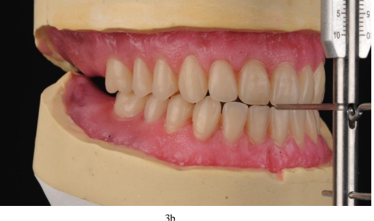
Fig. (3a and b). Set up of the denture teeth in an edge-to-edge relation with no horizontal or vertical overlap.

The prefabricated denture teeth were chosen to be out of