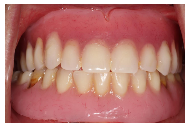
Fig. (1). Intraoral situation with the pre-existing prostheses.

A 54-year-old Caucasian female patient was referred to the Graduate Prosthodontics Clinic, Department of Prosthodontics, University of Athens. Her chief complaint was the appearance of her existing restorations, mentioning that she feels embarrassed to smile or speak even in front of her closest family members. Due to improper palatal seal, the existing maxillary denture had underextented flanges, insufficient border molding, and reduced retention and stability (Fig. 1). The mandible was restored with a removable partial denture without a metal framework and clasps. As the patient reported, the clinical and laboratory processes were accomplished by a dental technician without the involvement of a dentist.