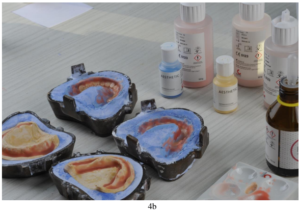
Fig. (4a and b). Laboratory processing of the prostheses placing different composite layers and extrinsic color agents.

The laboratory processing of the prostheses followed in the conventional manner (Xplex high-impact polymer, Candulor Dental GmbH, Germany). After deflasking, a surface layer of the labial flanges was grinded and then sandblasted in order to enhance the adhesion of the new composite layers and extrinsic color agents. An additional primer was used to coat the modified surface of the restorations, and light-cured composite resins were distributed utilizing the incremental layering technique. To mimic the area of the "attached tissue," a light pink shade without fibers was selected, combined with a fibered, slightly reddish pink color layer at the "mucosal part." The surface texture is also important for esthetic improvement. Thus, color variations were chosen for the cervical areas of the