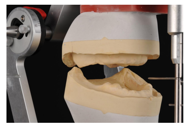
Fig. (2). The articulation of the casts after the clinical appointment of jaw relation records indicated the jaw relation.

Due to skeletal Class III relation (Fig. 2), it was preferred to set up the teeth in an edge-to-edge position with no horizontal or vertical overlap (Fig. 3a and b). By the intraoral try-in, the patient was satisfied with the planned result and reported that they were identical to her previously existing natural teeth.