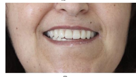
Fig. (8a and b). The final prostheses in the oral cavity.

Natural-looking restorations are more easily acceptable, and individualized appearance seems to be appreciated by the patient since it blends harmonically with the other facial characteristics [10]. Therefore, this constitutes one of the main strong points of the selected treatment plan. In addition to that, it is an affordable solution, especially in comparison to implant-assisted prostheses. Unfortunately, these techniques are not often included in daily-routine practices, which is one of the main limitations of this case report, probably due to a lack of relative awareness or because special techniques, materials, and, thus, money and extra time may be needed [11]. Nonetheless, in more complex cases like the present one, mainly due to the medical record, it is a very helpful instrument for better adaption and psychological enhancement.