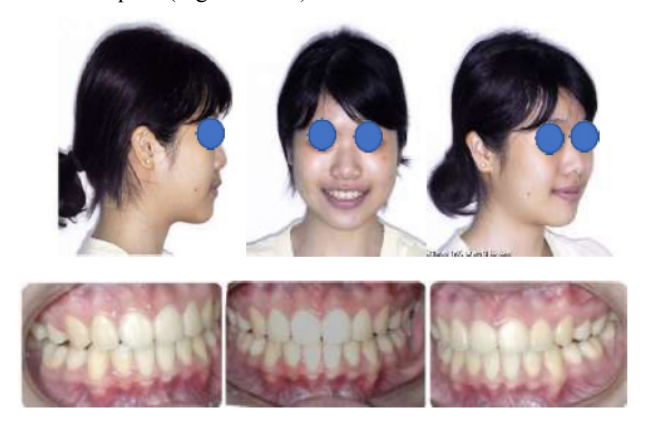
Fig. (4). Posttreatment intra and extraoral photographs.

Treatment options were given to the patient and parents, along with the pros and cons of each treatment. Informed consent was signed. The treatment plan chosen by the patient and parents were: (1) Extract four 1<sup>st</sup> premolar (14 24 34 44) to relieve the bimaxillary protrusion (2) Extract mandibular right and left second molar (37 47) without damaging the alveolar bone and (3) Mesialize both mandibular 3<sup>rd</sup> molar (38 48) to close the space (Figs. 4 and 5).