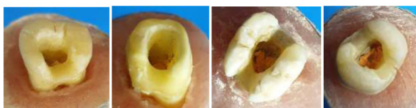
Fig. (1). One of the specimens prepared for group LB, LS, MDB, MDS (left to right).

In groups LB and LS, the lingual wall was removed up to