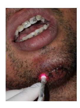
Fig. (7). Extraoral view at the time of PBMT.

After 8 months of laser therapy, the root canals were filled with gutta-percha cones and a bioceramic sealer. The teeth were restored with composite resin, and occlusal adjustments were made. (Figs. 9-14).