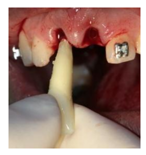
Fig. (3). Removal of the contaminated coagulum from the sockets prior to teeth replantation.

After root canal treatment and replanting of the teeth, local anesthesia was used to rinse and remove the contaminated coagulum from the sockets. Functional splinting with orthodontic 0.016 archwire and composite resin was fixed from tooth #13 to tooth #23 (Figs. 3-5 ). The splint was removed 1 month later.