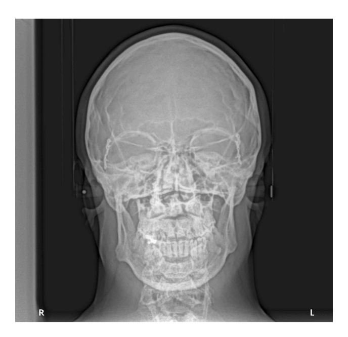
Fig. (2). Postoperative postero-anterior cephalometric radiograph.

The presented case was treated with orthodontic treatment, Le Fort-I osteotomy, and Le Fort-III osteotomy with distraction osteogenesis (DO). The Le Fort-I osteotomy is a common surgery performed to correct midface deformities. It is used to treat cases with Class-II and III malocclusion, facial asymmetry, obstructive sleep apnea, and maxillary atrophy. It should be preceded by proper orthodontic treatment [40]. In this case, Le Fort-I osteotomy was performed to expand the palate. It was performed two times due to