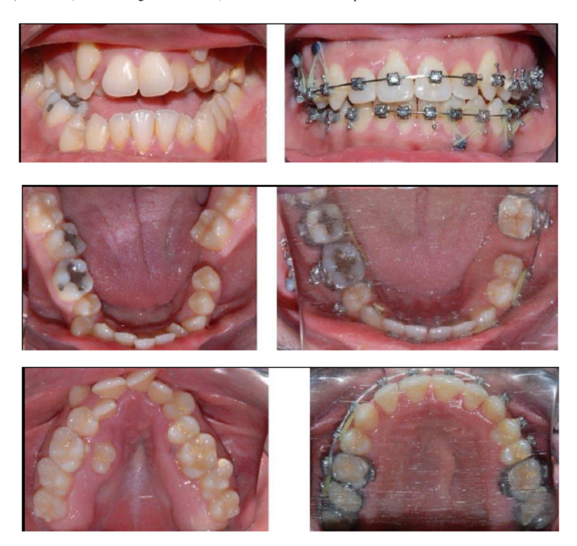
Fig. (1). Intraoral pre-orthodontic and post-orthodontic treatment photographs.

hypoplasia, and no upper or lower extremity defects, which distinguishes CS from Apert and Pfieffer syndromes. The orthodontist diagnosed him with Crouzon's syndrome. The patient reported that he was diagnosed with Gravis disease when he was 15 years old. In addition, he reported a history of sleep apnea and mouth breathing. The patient was mentally healthy and had no family history of a similar complaint. Intraoral examination revealed maxillary retrognathism, high narrow collapsed palate, Class-III malocclusion, crowded maxillary teeth, anterior open bite, higher buccal maxillary canines, malposed palatally erupted upper right second premolar, loss of mandibular left first molar, and malposed incompletely erupted right first premolar (Fig. 1). Radiographic examination revealed that the coronal and sagittal sutures had been obliterated and that the skull had protruding cranial marks on the inner surface of the cranial vault, which appeared as many radiolucencies looking like depressions giving the appearance of a copper hammered appearance (Fig. 2). The results of the haematological tests were normal. No genetic tests were performed.