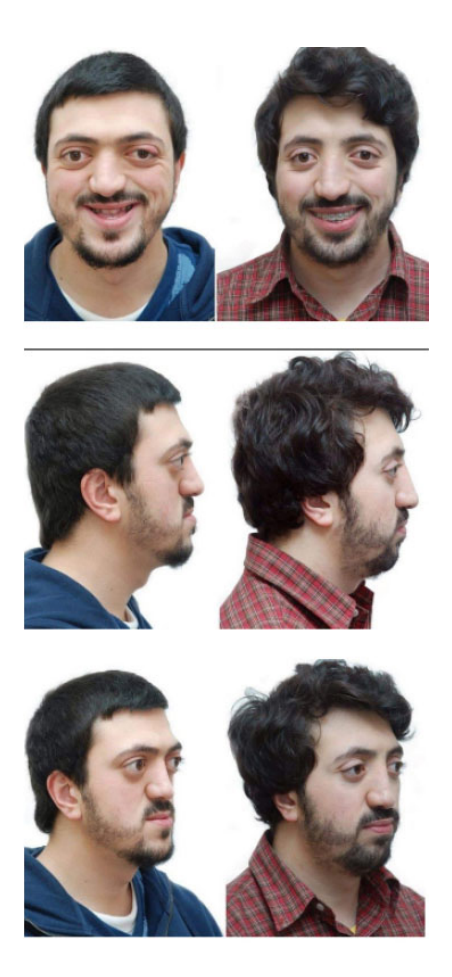
Fig. (4). Extraoral clinical photographs showing preoperative and postoperative frontal, lateral and oblique profile views.