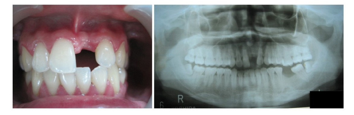
Fig. (1). Intra-oral clinical appearance and panoramic radiograph at baseline.

Five months after the GBR procedure (Fig. 2F), alveolar ridge thickness reassessment exhibited bone volume improvement into 6/6/6 mm (coronal/middle third/apical third of the alveolar ridge). This thickness was quite ideal for anterior implant placement. Then, at the second surgery, the flap was reopened, and a 3.5 mm (diameter) x 10 mm (length) of bone-level implant (Straumman) was inserted accordingly (Fig. 2G-2I). The tension-free flap was closed and sutured using 5.0 nylon (Fig. 2J, K). After the surgery, the patient was instructed to use chlorhexidine gluconate 0.12% mouthwash two times/day for 2 weeks and to take care of personal oral hygiene. Two weeks after the second surgery, no sign of rejection was noticed, after which the stitches were removed. A provisional crown made from the composite resin was screwed to the implant to create a better emergence profile of the gingiva; the final crown was placed later. Twelve months from baseline, the implant was stable without any sign of inflammation or implant tread exposure (Fig. 2L). On the top of that, patient is satisfied with the outcome.