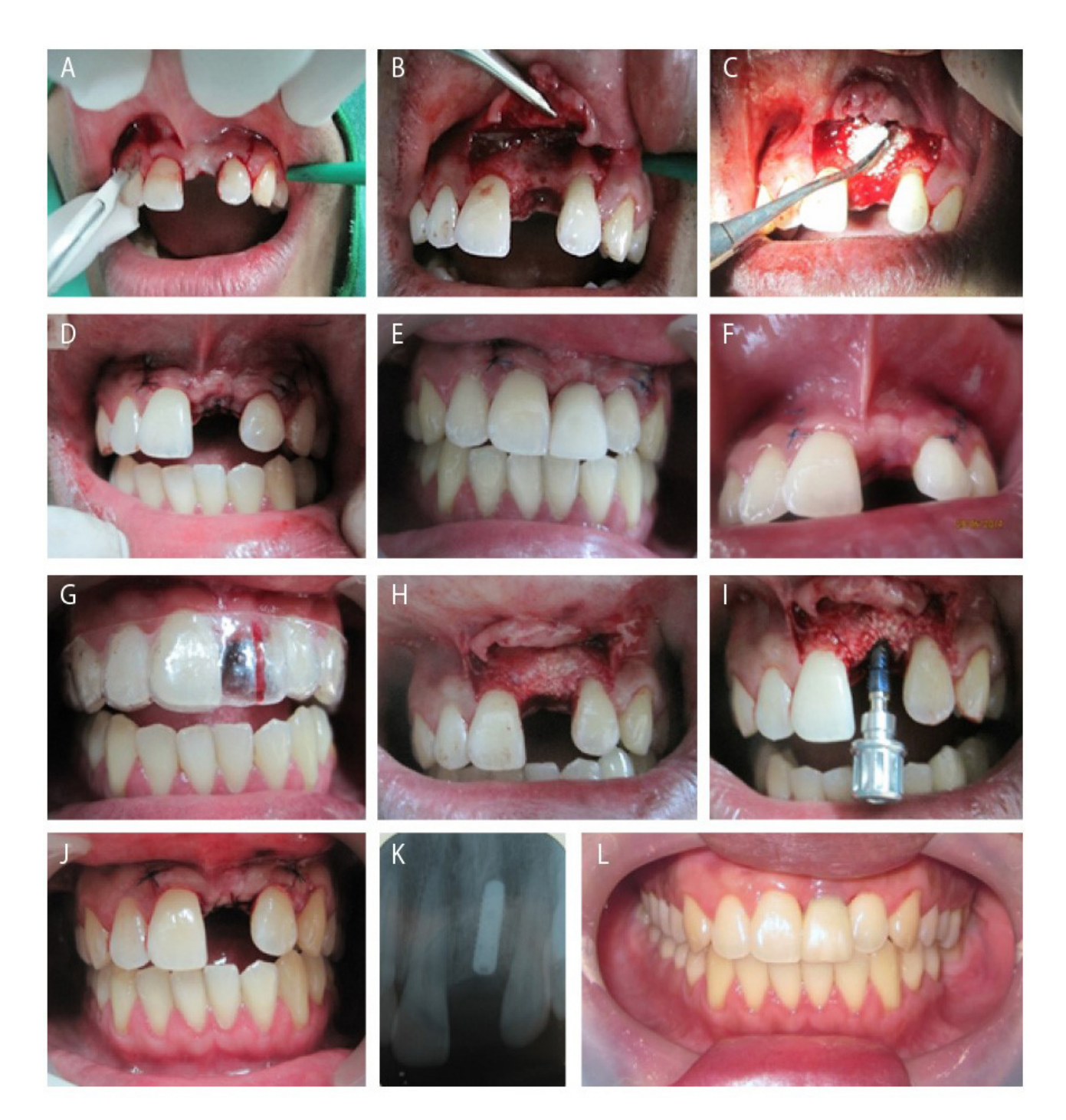
Fig. (2). A Vertical incisions were made on the 2/3 of mesial angle of adjacent teeth. B Full thickness flap was elevated. Bone decortication was made using a slow-rotating small diameter bur. C Bone graft was applied. D Nylon 5.0 was used to suture the flap. E Removable denture was placed gently. F Five months after GBR procedure. G-K At the second surgery, flap was re-opened, an implant was inserted accordingly, and flap was sutured. L. Twelve months from the baseline.