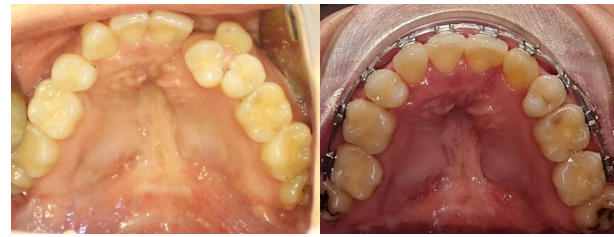
Fig. (1). (A) Pre-treatment occlusal view of a cleft palate case. (B). Orthodontic management of cleft patients depicting the expansion of the maxillary arch to align and improve the esthetics of an affected individual.

Many cleft-treated patients previously reported speech and facial defects because of nasolabial surgical repair that hampers their social lives. This led to the evolution of techniques for their management, and Distraction Osteogenesis came into the limelight as a revolutionary modality for cleft treatment [8]. It involves the separation of osteotomized bone segments, which are then stimulated to form new bone, thereby increasing the length of the bone. It has found extensive uses in the treatment of both unilateral and bilateral cleft patients and other syndromic patients such as hemifacial microsomia. The evolution of temporary anchorage devices or mini-screws as they are more popularly called has added to the repertoire of orthodontists who can use these to carry out selective tooth movement without unwanted effects on the adjacent teeth [9]. With the development of additional modalities such as aligners, cleft patients needing complex surgeries can be treated without compromising the outcomes [10, 11].