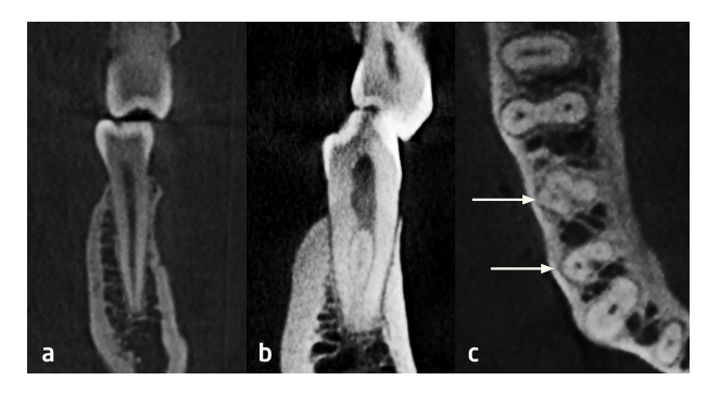
Fig. (2). CBCT slides of mandibular first and second premolars showing; a . coronal view of 1^{st} premolar with one canal, b . coronal view 1st premolar with 2 canals, c . axial views at mid-roots of 1^{st} premolars with 2 canals (lower arrow) and 2^{nd} premolars with 3 canals (upper arrow).

canal. Most of the teeth in both right and left sides, with no significant difference, had a Vertucci type I or V canal configuration, and few were found with a Vertucci type III or VII canal configuration. Five teeth on the right side and two teeth on the left side had other types of root canal configuration.