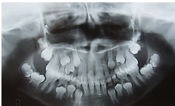
Fig. (2). Pretreatment panoramic radiograph showing the maxillary left geminated central incisor and the right supplemental supernumerary tooth.