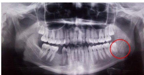
Fig. (1). Retromolar canal identified on panoramic radiography.