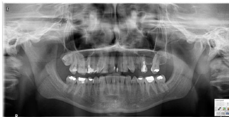
Fig. (1). Patient's orthopantomogram.

The results of blood tests are listed in Table 1.