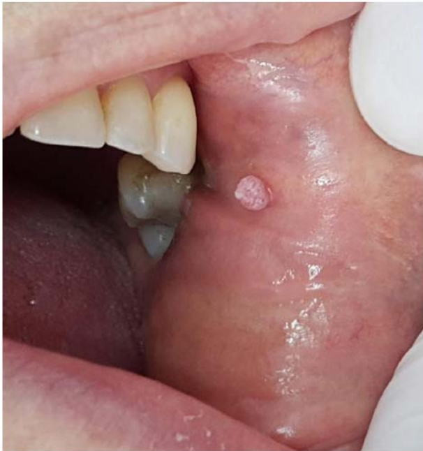
Fig. (1). Photomicrograph showing initial lesion before excision.

and lips, or other locations [1-5,7,9,10]. The differential diagnosis includes the following entities: verruca vulgaris, multifocal epithelial hyperplasia, condyloma acuminatum, and papillary squamous cell carcinoma [1, 2, 6, 7, 11].