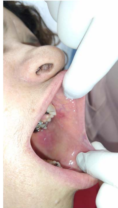
Fig. (5). Photomicrograph after one-month follow-up.

of this study were in agreement with the above mentioned statement because no pain medication was required after the excision procedure, and wound healing was notable and rapidly achievable. This technique is also practical because diode laser devices are portable and have a significantly lower cost than other high-power lasers, namely Nd: YAG, Argon, and CO 2 lasers.