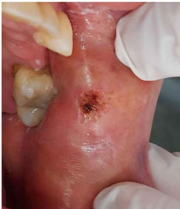
Fig. (2). Photomicrograph showing lesion immediately after excision with diode laser.

The treatment of choice for HPV consists of complete surgical excision, including the base of the lesion and a small area of surrounding tissue to prevent recurrence [1, 3, 4, 7, 12]. This procedure can be performed with a conventional scalpel,