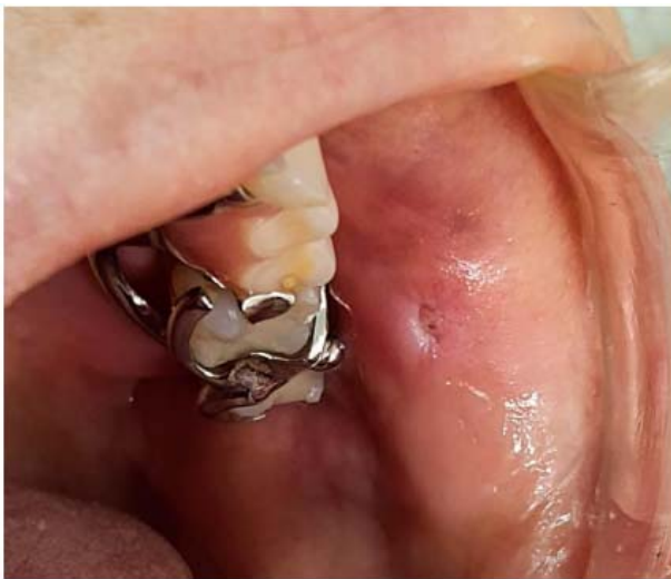
Fig. (4). Photomicrograph after one-week follow-up.

Squamous papillomas are benign mucosal masses commonly induced by HPV-6 and HPV-11. The lesions generally measure less than 1 cm in size and appear as pink to white exophytic granular or cauliflower-like surface alterations. They may be found on the vermilion portion of the lips and at any intraoral mucosal site, with a predilection for the hard and soft palate and the uvula [3 - 5, 14, 15]. The clinical appearance, history and site of the lesion in the present case were appropriate for common identification of oral squamous papilloma. The oral pathology report confirmed the pre-surgical clinical diagnosis.