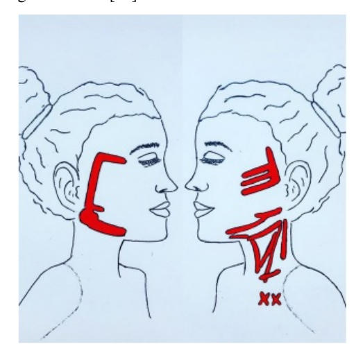
Fig. (2). Illustration of the patient and the pain patterns indicated by her. - Designed by Giulia Giancaspro.

joint, teeth, jaws, salivary glands, oral mucosa, and skin [30]. The International Association for the Study of Pain (IASP) defines trigeminal neuralgia as "a sudden, usually unilateral, severe, brief, stabbing, recurrent pain in the distribution of one or more branches of the fifth cranial nerve". [31, 33] Also, according to the IASP, neuropathic pain is initiated or caused by a primary lesion or nervous system dysfunction [34]. In a minority of cases, trigeminal neuralgia is secondary to benign or malignant tumors [31].