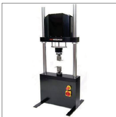
Fig. (2). Universal mechanical testing machine for measuring load on teeth assessing resistance to fracture.