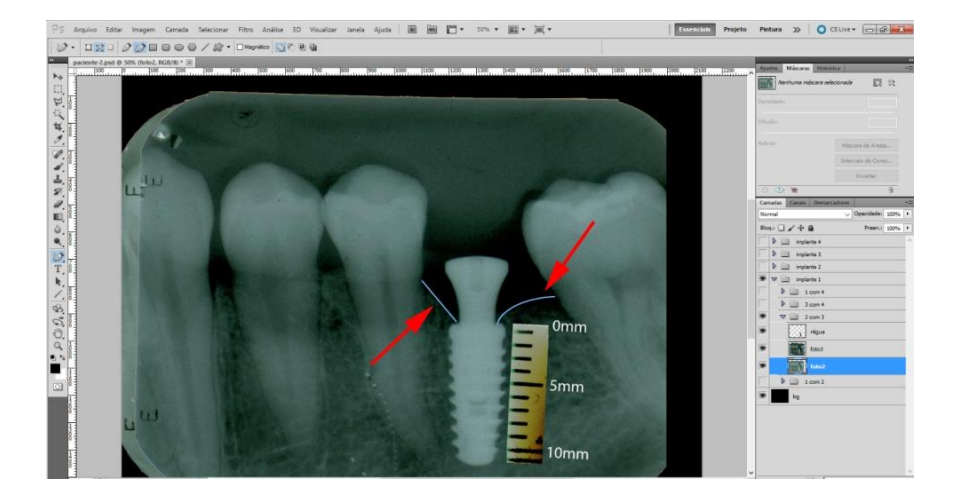
Fig. (3). After we superpose the latest radiograph.