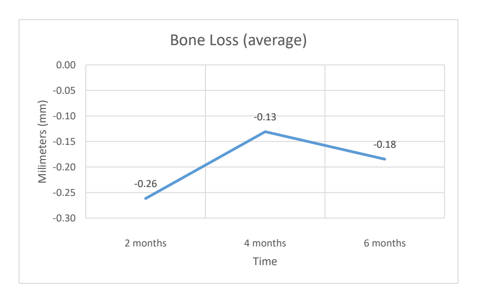
Fig. (5). Bone loss (average).

The periapical radiographs were obtained using the parallelism technique by an individualization (bite guide) of the radiographic positioning (Cone Est. Química - Maquira), using a condensation silicone (Optosil- Comfort Putty) at the teeth support site, making the patient biting always in the same position. Radiographic film (Contrast Speed E-DFL) was used with SpectroII X-ray equipment (Dabi-Atlante, Brazil), with a peak kilovoltage fixed at 67, an exposure time of 0.6 seconds and fixed milliamps at 8mA.