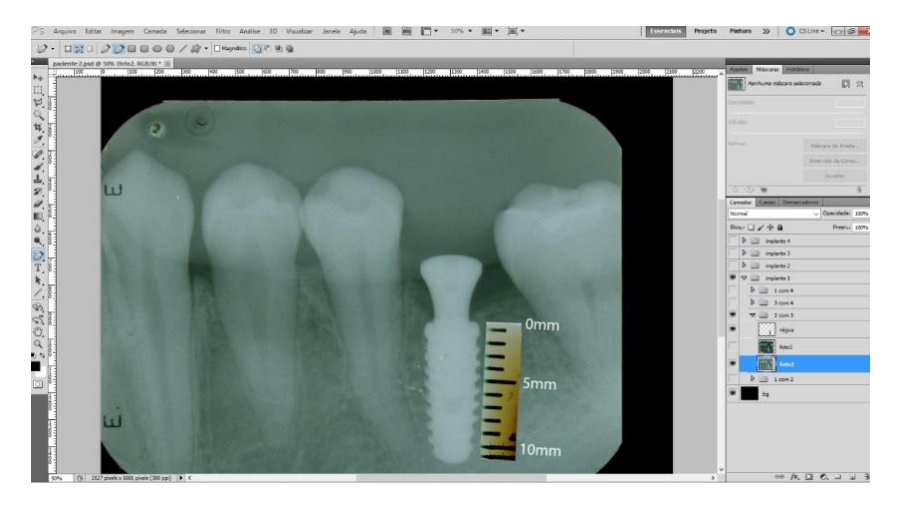
Fig. (2). Image inserted on Photoshop it was marked the bone level on the mesial and distal side of the implant for future comparison.

implant bone of the mesial and distal sides were found in periapical radiographs (Figs. 3, 4).