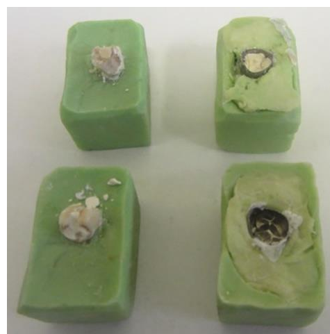
Fig. (3). The specimens after the crown retention test.