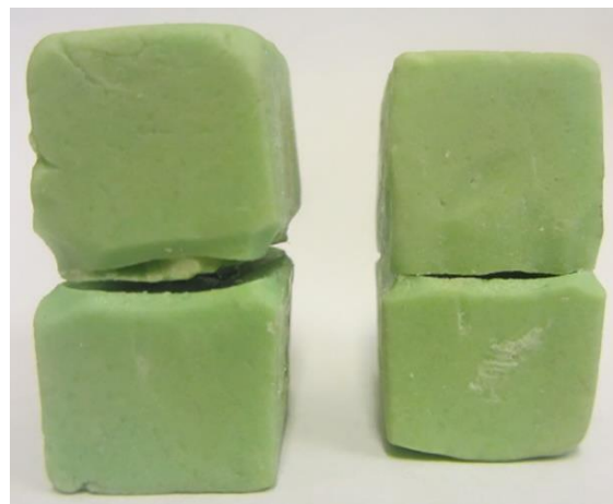
Fig. (1). The crowns embedded in an acrylic resin cap.

independent sample t-test ( \alpha=0.05 ).