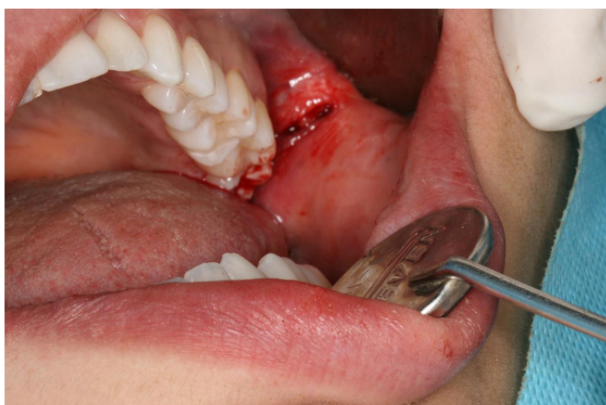
Fig. (1). Incision made in the cheek mucosa next to the buccal surface of the molars.