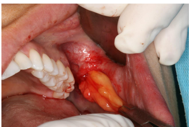
Fig. (2). Removing BFP carefully.