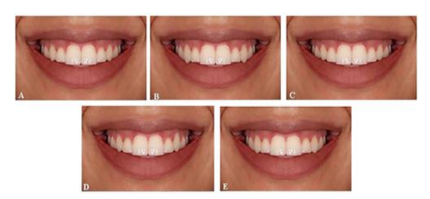
Fig. (1). Set one of the smile photographs with various lengths of canines. A. Canine tip of the same height as the central incisor edge (0), B. Canine tip longer by 1 mm in relation to the central incisor edge (+1), C. Canine tip shorter by 1 mm in relation to the central incisor edge (-1), D. Canine tip shorter by 0.5mm in relation to the central incisor edge (-0.5), E. Canine tip longer by 0.5 mm in relation to the central incisor edge (+0.5).

USA). The length and gingival height of canines in relation to central incisors and width of canines (to follow the rules of Golden Proportions) were altered in relation to the lateral incisors. Based on modifications, three sets of photographs were prepared and these digitally altered photographs were used for data collection Figs. (1-3).