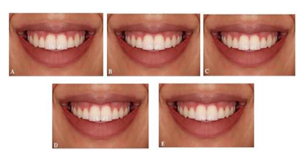
Fig. (2). Set two of smile photographs with various heights of gingiva of canines. A. Gingival height longer by 1 mm in relation to the central incisor (+1), B. Gingival height of the same height as the central incisor (0), C. Gingival height longer by 0.5 mm in relation to the central incisor (+0.5), D. Gingival height shorter by 1 mm in relation to the central incisor (-1), E. Gingival height shorter by 0.5 mm in relation to the central incisor (-0.5).