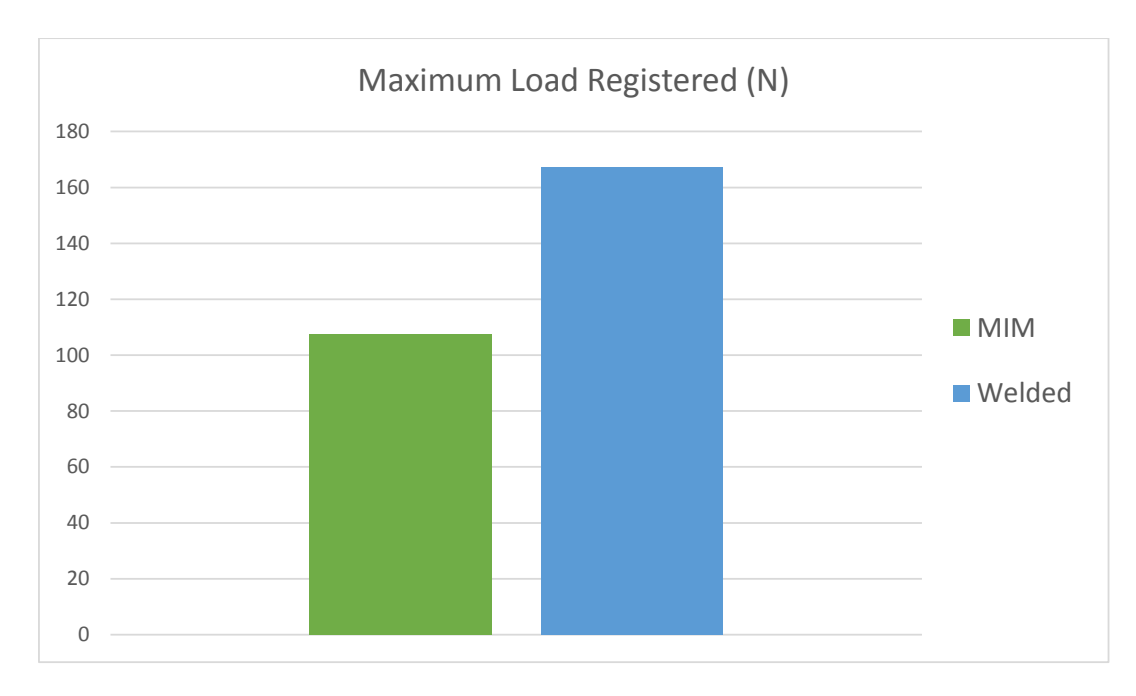
Fig. (6). Maximum load registered in MIM and welded bases.