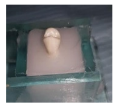
Fig. (1). Specimens.

Group 1: 20 MIM (metal injection molding) technology stainless steel brackets for first mandibular premolars (Roth 0.022" x 0.028", Masel Enterprise, Bistrol, USA).