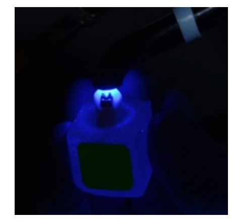
Fig. (2). Light curing after bracket positioning.

The adhesive system used was Transbond XT (3M, Unitek, Monrovia, USA). A thin layer of the primer was applied for 10 seconds and light-cured for 30 seconds with an 1800 mW Woodpecker Led-F light curing light, wavelength 420-480 mm<sup>2</sup>. After a uniform layer of the resin was applied to the base of the brackets, and were positioned in the center of the clinical crown exerting pressure toward the tooth, excess of resin was removed from the bracket margins and light-cured for 60 seconds (Fig. 2 ). All specimens were prepared and brackets were bonded by the same operator (L.A.V.I).