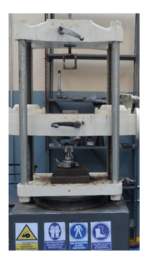
Fig. (3). Universal testing machine used for the shear test.

The tooth blocks were held in an upright position, and a beveled stainless-steel tip 1mm high and having a 10mm wide active edge was attached to the load cell #2 of the testing machine, positioned and rested on the resin plateau to test the bonding interphase between the bracket base and the resin (Fig. 4). The machine was then driven at a speed of 0.5 mm per minute in the direction of compression, thus developing a shear stress at the bracket-resin interphase until the fracture or rupture of the adhesive union. The values were recorded directly in kgf/cm<sup>2</sup> on the digital monitor of the testing machine.