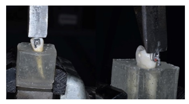
Fig. (4). Shear test of the brackets performed with chisel.

maximum shear bond strength of 24.43 MPa and a minimum strength of 3.22 MPa, an average of 9.58 MPa, and a standard deviation of 5.80 MPa, with a maximum load registered of 274.13 N and a minimum load of 17.70 N.