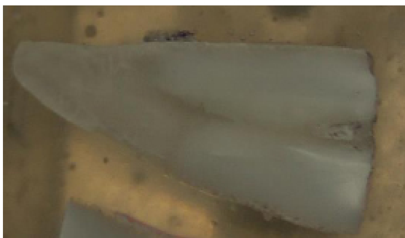
Fig. (1). Root section was embedded in self-curing acrylic resin, and the root canal dentin surface was facing up.

direction and obtaining mesial and distal sections. Each root section was embedded in self-curing acrylic resin; the internal surface of root canal dentin was faced up (Fig. 1). The surface was flattened sequentially with 600, 1000, 1500 silicon carbide papers. Subsequently, each specimen was tested using a Vickers Hardness Tester (Shimadzu HMV-2, Shimadzu Corporation, Kyoto, Japan) with a ten-gram load of indenter (15 seconds) (Fig. 2). Three indentations at a distance of 200 \mu\text{m} from each other were done on the apical third of each root [22]. The indentations were viewed on the computer screen connected to the micro-hardness tester. Three indentations then were averaged to determine the value of micro-hardness (in VHN) of each specimen. Data obtained were analyzed statistically using One-Way ANOVA and Tukey's test with a significance level of 95%.