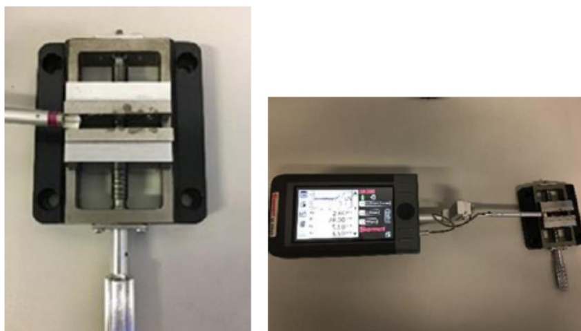
Fig. (3). The specimen was placed on the flat table surface, and a clamp was used to hold specimens stable in its position (A), the values of surface roughness were displayed digitally on the screen of the portable digital roughness (SR 300, Taylor Hobson, Leicester, England) (B).