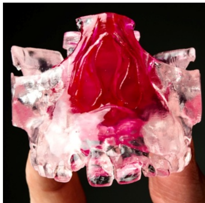
Fig. (3). A three-dimensional maxillary model. Clear plastic represents bone, and red plastic represents soft tissue.