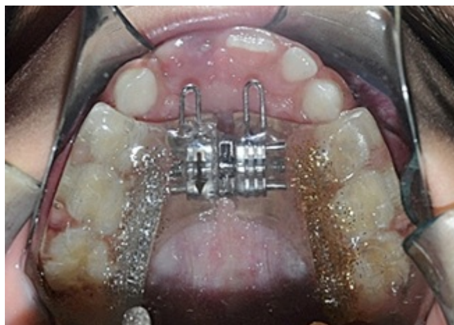
Fig. (1). Bonded Hyrax expander.

Cronbach's alpha values were 0.66 and 0.53, indicating acceptable reliability at both time points. The mean (SD) number of symptoms patients' guardians reported was 1.21 (1.45) symptoms pre-treatment and 0.43 (0.84) symptoms post-treatment ( p < 0.001 , paired t -test), with the mean (SD) difference being 0.79 (1.47).