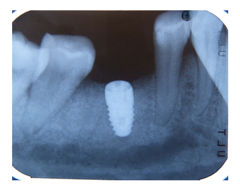
Fig. (10). Implant follow up. Radiograph 4 months after implant insertion. No signs of bone resorption were detected.