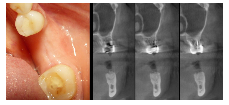
Fig. (7). Soft tissues healing after 6 months (left side). The cone bean scans showed a good integration between native bone and the autologous dentin graft. No signs of inflammations were present and the vestibular cortex was regenerated (right side).