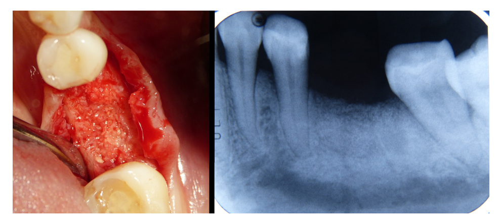
Fig. (8). Clinical aspect of the regenerated hard tissue (left side). A complete graft integration without any presence of inflammatory of connective tissue was evident. The radiograph (right side) showed no radio-opacity difference between the regenerated tissue and the surrounding bone.