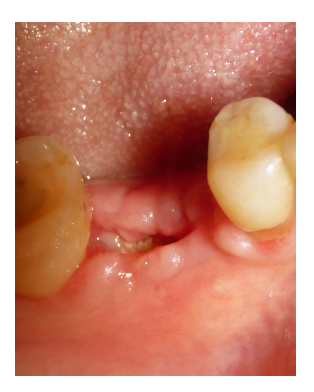
Fig. (5). Soft tissues healing after 10 days. No clinical signs of inflammation or infections are detected.