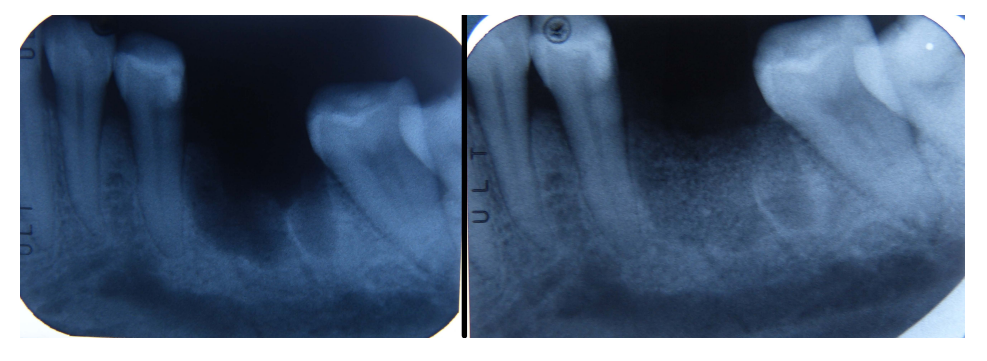
Fig. (4). Post extractive radiograph prior grafting procedures (left side). Radiograph after autologous dentin graft (right side): the complete filling is evident.