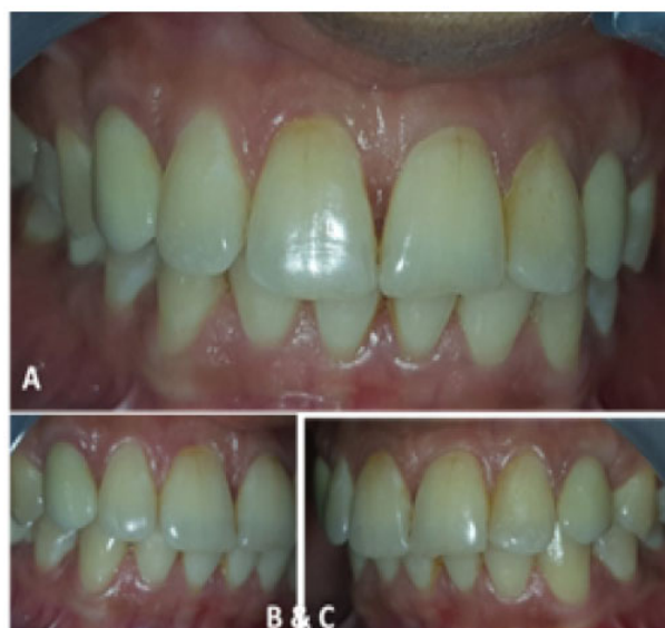
Fig. (5). Three years intra-oral post-operative view.

The patient was scheduled for follow up after 6, 12, 24, and 36 months. The implant-supported restorations showed good soft tissue appearances with the absence of inflammation and gingival recession. The interdental papillae looked normal and enhanced the optimal aesthetic result obtained using the definitive all-ceramic crowns (Fig. 5A-C and Fig. 6A-C). The patient had given standard oral hygiene instructions during her recall appointments.