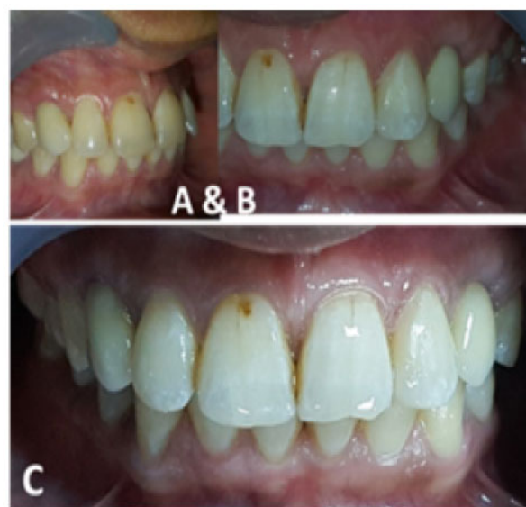
Fig. (4). Post-operative frontal, right and left intraoral views.

All-ceramic crowns were tried in the patient’s mouth. Interocclusal adjustment, canine guidance, protrusive and lateral movements were checked. The glazed all-ceramic crowns were cemented with Rely X, TM, Unicem AppliCap Resin Cement (3M ESPE, Germany) following the manufacturer’s instructions (Fig. 4A-C).