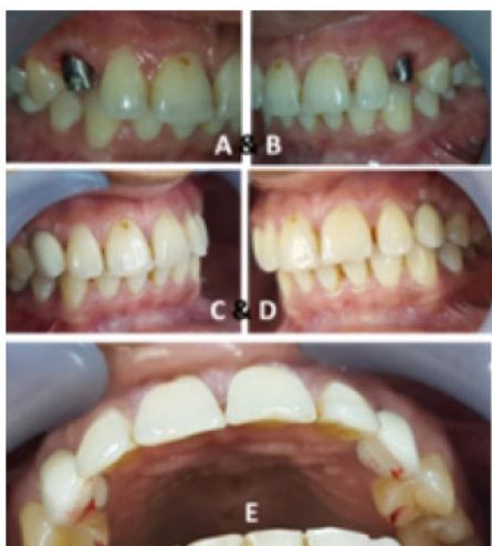
Fig. (3). Three months from crown lengthening and during new provisional crowns adjustment.

Three weeks later, the provisional restorations were removed, and impression copings were screwed onto the top of the implant. A light-polymerizing resin material was injected around the impression copings to prevent the soft tissues from collapsing onto the impression copings. An open-tray technique was used for the final implant level impression of the maxillary arch by using a plastic stock tray with additional silicone (Zermakh, Italy). A 2M2 3D-Master shade was selected using a digital VITA System 3D-Master shade guide (VITA Easyshade Compact, Vita, Germany) in accordance with the manufacturer’s instructions. A maxillary master cast was poured with an improved dental stone and mounted manually in maximum intercuspation with the mandibular cast by using a Di-Lok tray (Di-Equi Dental Products, Wappingers Falls, NY).