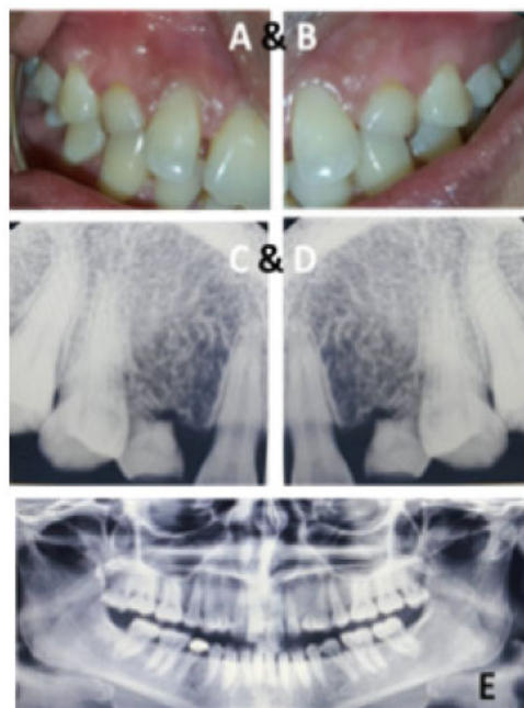
Fig. (1). Pre-operative right and left intraoral and panoramic views.

taken to check the position of the implants concerning the extraction sites (Fig. 2C). The primary implant stability of 35 Nm torque was confirmed. The flap was sutured in place by using the vertical mattress technique.