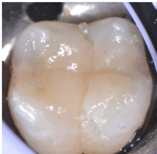
Fig. (3). Final composite restoration. For the final step, the restoration was first evaluated. Then, finishing and polishing was done. The contours of the resin were corrected, followed by the polishing of the surface. This would help reduce the roughness of the surface, which could serve as retention area for plaques.