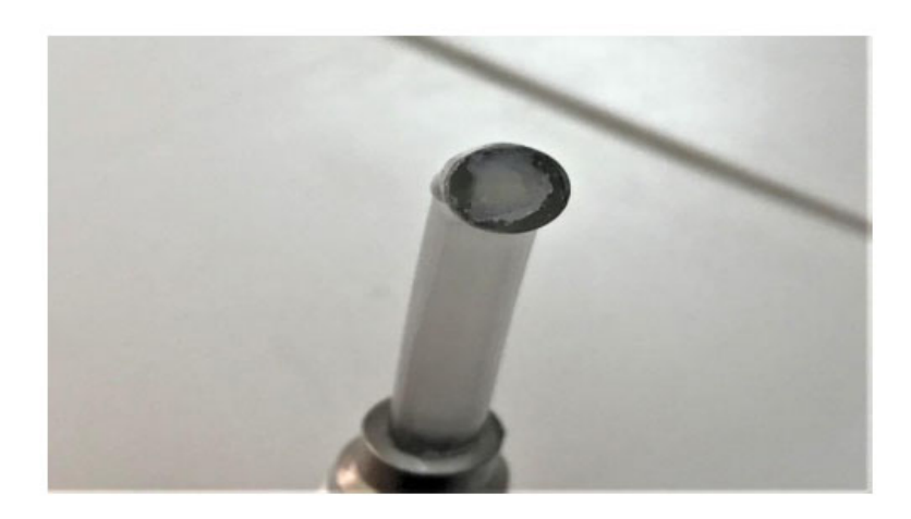
Fig. (1). A layer of composite residue covering most of the tip of one LCU as received before cleaning.