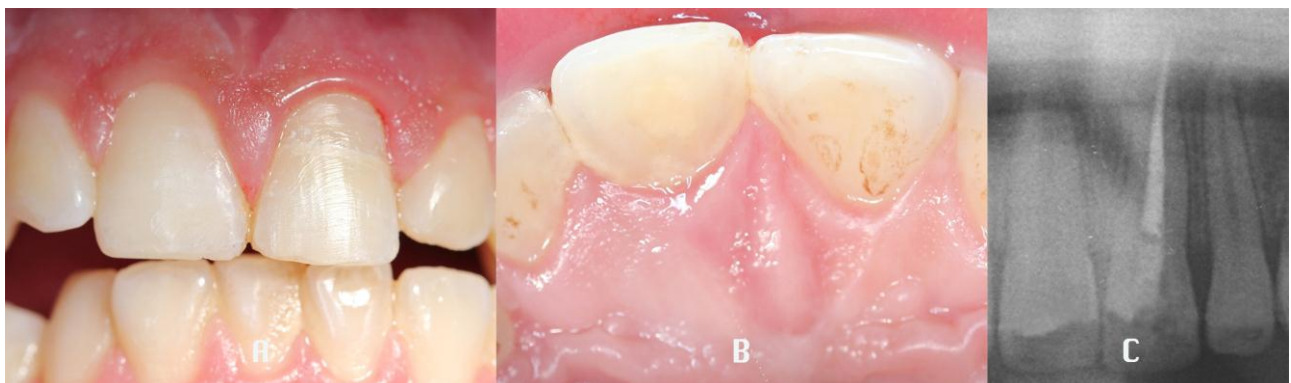
Fig. (3). Six months follow-up A) Buccal view B) Palatal view C) Intraoral Rx.