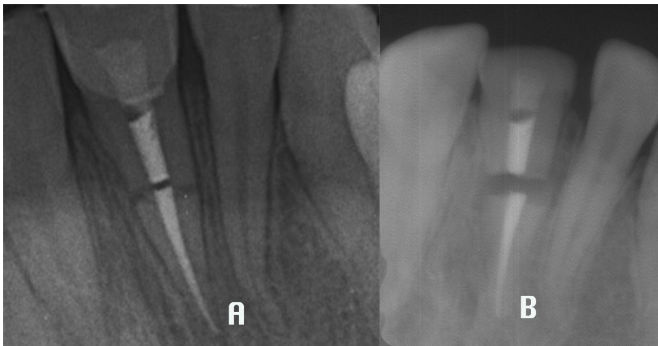
Fig. (4). Rx follow-up: Root fracture line widening A ) 12 months follow-up B ) 36 months follow-up.

The age was the only numerical variable and it was expressed as mean, standard deviation, median, minimum and maximum; the categorical variables were expressed as numbers and percentages. The non-parametric approach was used because of the low sample size. The Cochran test was applied in order to evaluate the existence of significant differences for the presence of diastasis, inflammation, mobility, sensitivity and pulpal lesions in four different times (basal, 6, 12 and 36 months). The Mc Nemar test was estimated to perform statistical comparison between two consecutive times for each parameter. In order to evaluate the association between sex, fracture, dislocation, repositioning and splint with presence/absence of diastasis, inflammation, mobility, sensitivity and pulpal lesions (for each time), the Pearson’s P square was applied; alternatively, the exact Fisher test was estimated, when a frequency in the contingency table was less than 5. P < 0,050 two sided was considered to be statistically significant. Statistical analyses were performed using SPSS 17.0 for Window package.