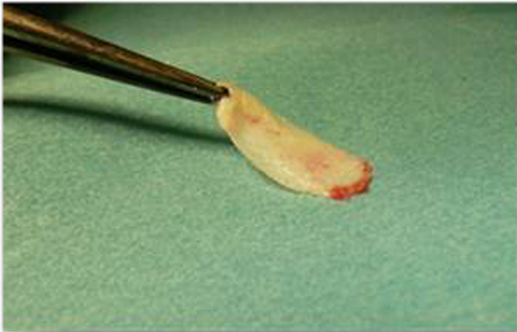
Fig. (3). Parts rich in fibrin were pressed manually between gauzes in order to obtain autologous rich-in-fibrin membranes.