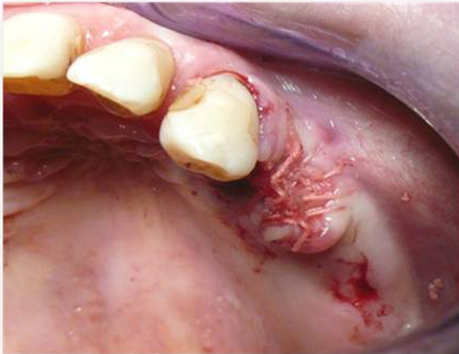
Fig. (4). Closure of the sockets was realized using autologous fibrin membrane after filling the socket with a mixture of Demineralized freeze dried bone allograft. A polyglactin absorbable suture is used to close the socket.