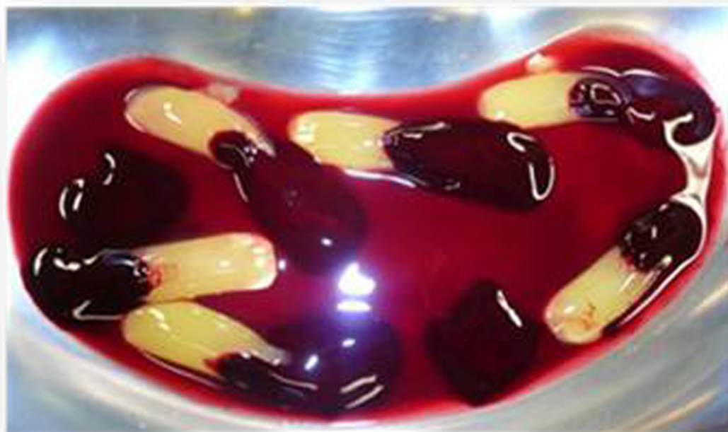
Fig. (1). Platelets concentrates (platelet-rich-fibrin) were obtained by centrifugation of blood samples.

A retrospective radiological clinical study was designed. The inclusion criteria were patients older than 18 years who had undergone dental extractions prior to implant treatment in our department. Their teeth had been extracted due to severe dental decay, fractures or periodontal disease.