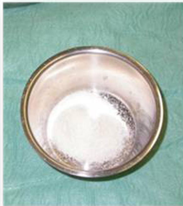
Fig. (2). Demineralized freeze dried bone allograft 300 - 500 \mu\text{m} .

At the beginning of surgery, platelet concentrates (platelet-rich-fibrin) were obtained by centrifuging patient blood samples in 10-ml tubes with no anticoagulant adjuvant at 3000 rpm for 10 minutes following a protocol described previously [22]. A portion of the centrifuged blood rich in platelets (named buffy-coats) was cut and mixed with particulate DFDBA (produced in Hôpital Erasme- ULB- Brussels) 300-500 \mu\text{m} (Figs. 1 and 2). A portion rich in fibrin was pressed manually between gauze to obtain autologous rich-in-fibrin membranes (Fig. 3). Atraumatic extractions were realized, and immediately after extraction, the socket was filled with a mixture of DFDBA and platelet concentrates. Closure of the sockets was realized using an autologous fibrin membrane to cover the filled socket and a polyglactin absorbable suture to close the socket (Fig. 4).