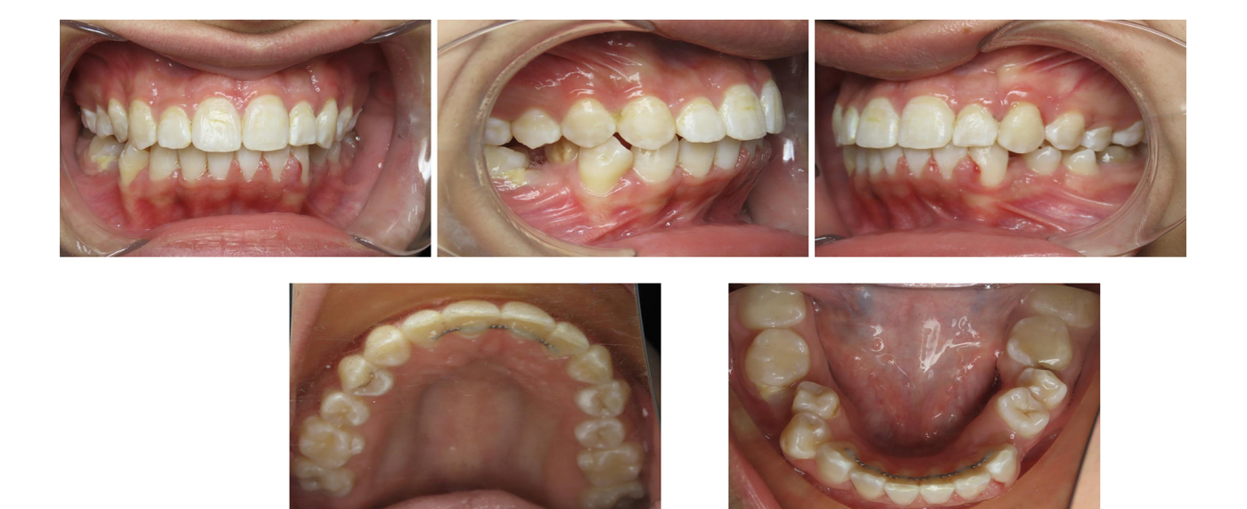
Fig. (5). Post-treatment intraoral photographs after two months of treatment.