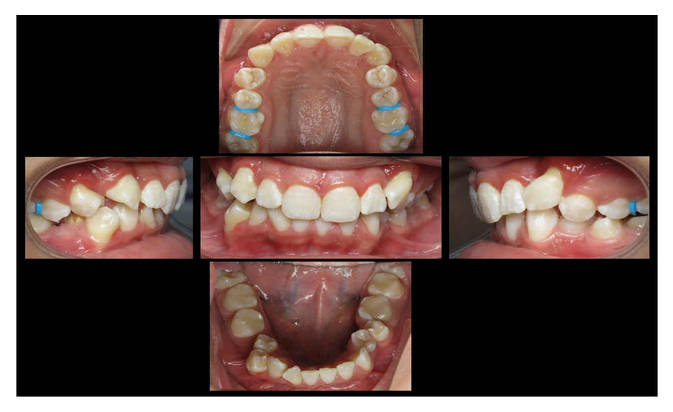
Fig. (1). Pretreatment intraoral photographs.

The panoramic radiograph showed an asymmetric condyle with multiple supernumerary teeth in the anterior and posterior area of the maxilla and mandible (Fig. 2a ). A cone beam computed tomography (CBCT) was taken. It showed multiple supplemental impacted supernumerary teeth located mainly in the premolars and canine's area (Fig. 2b ).