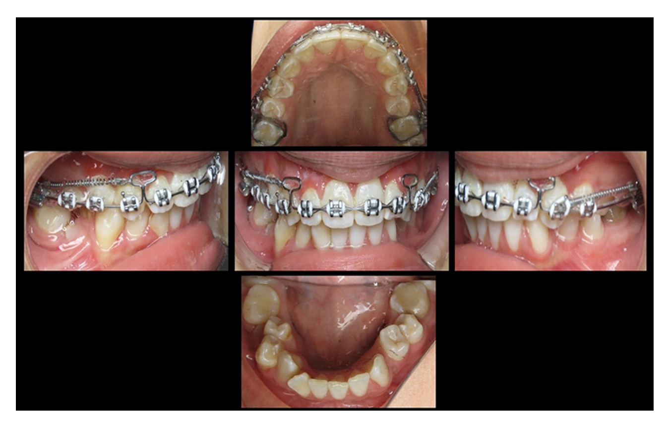
Fig. (3). Intraoral photograph after 15 months of orthodontic treatment.